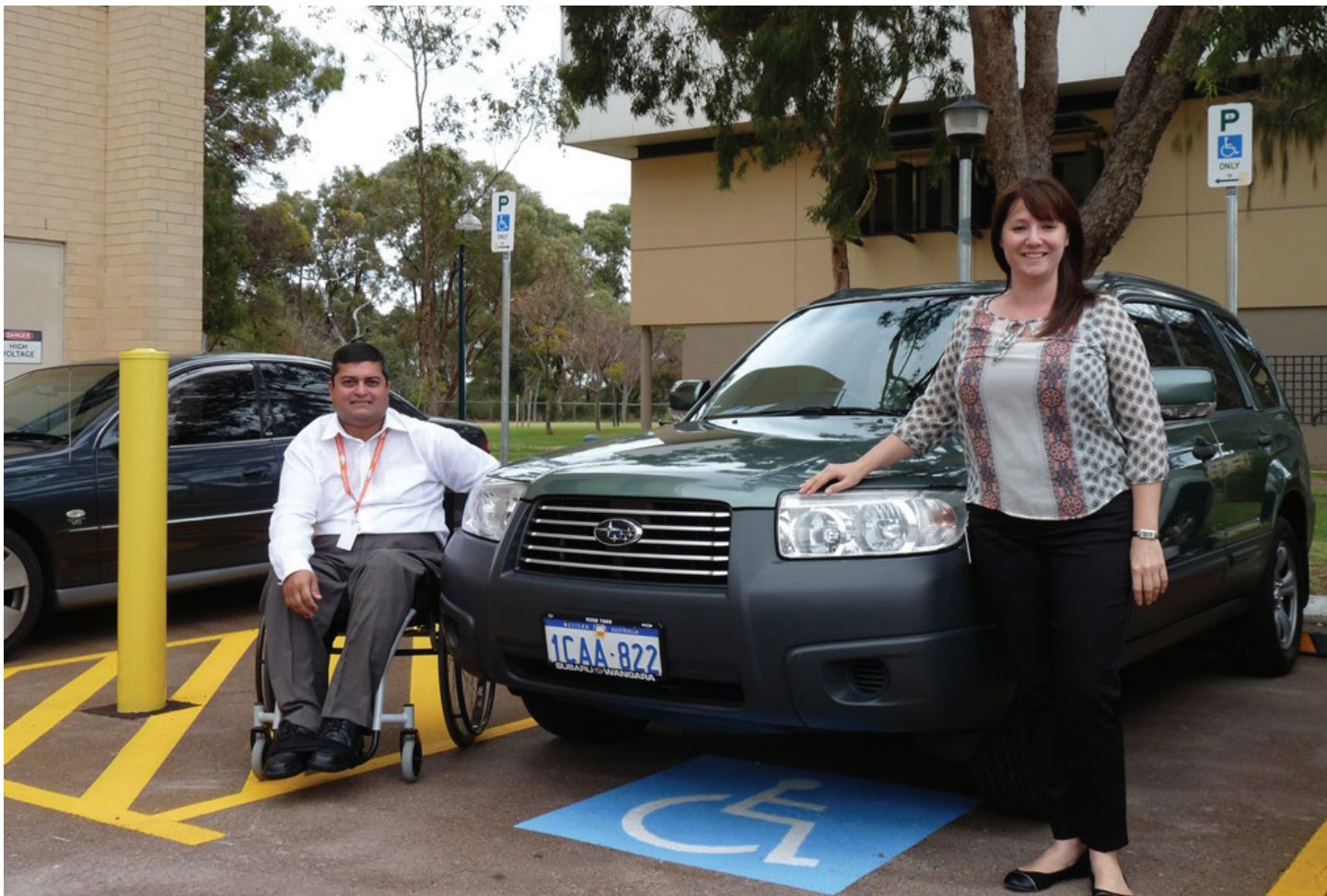
Increased disabled parking bays at the Administration Centre, including two new bays for staff