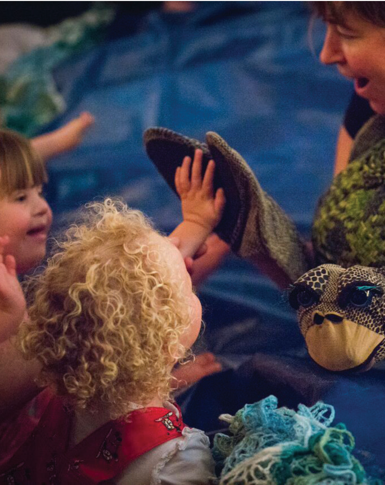
Sensorium 2 – a project funded through the City’s Community Funding Program