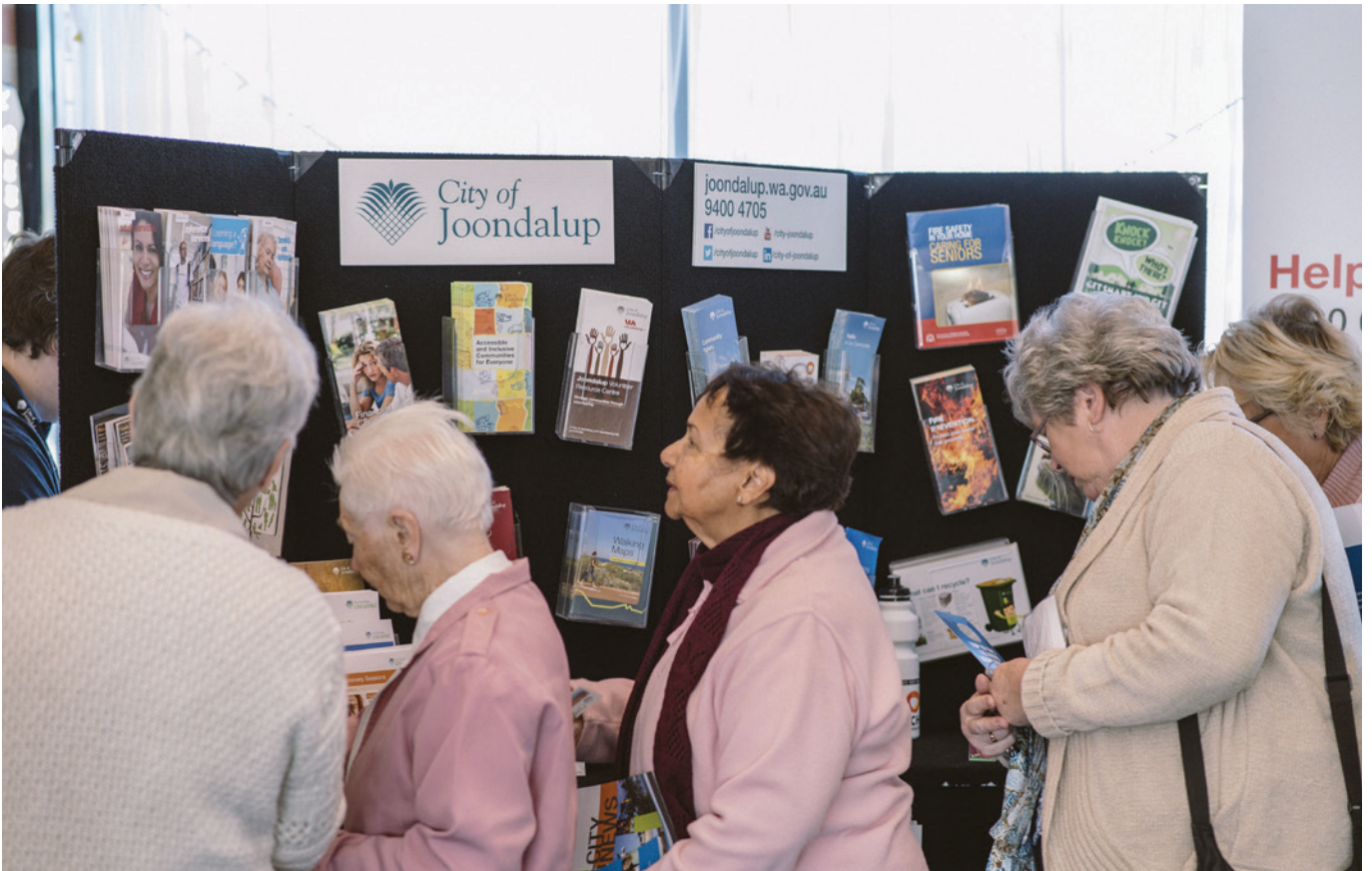
Residents accessing information at Art of Ageing event

Outcome 3: People with disability receive information from the City of Joondalup in a format that will enable them to access the information, as readily as other people are able to access it.