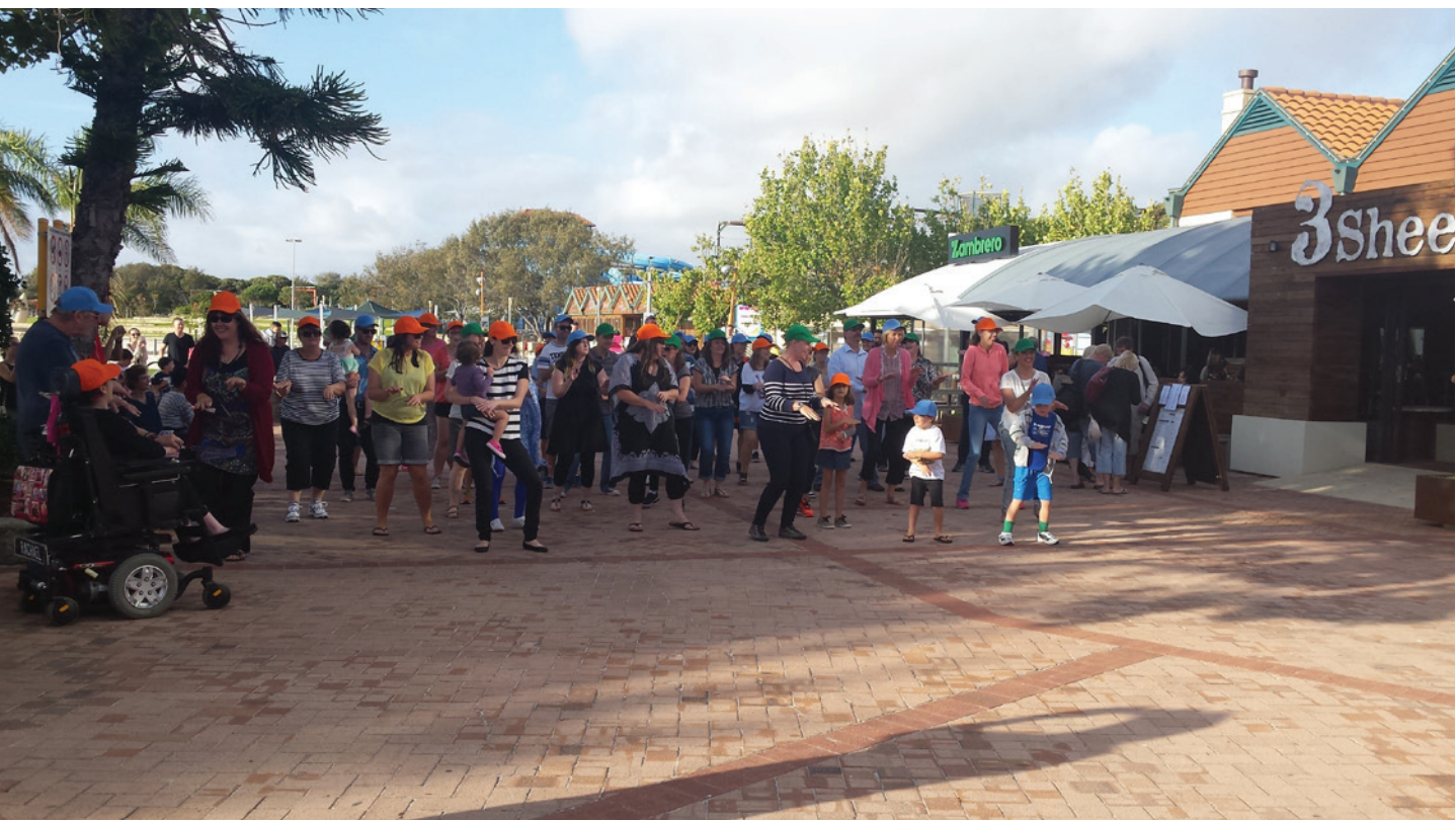
Flash mob celebrating International Day of People with Disability 2014