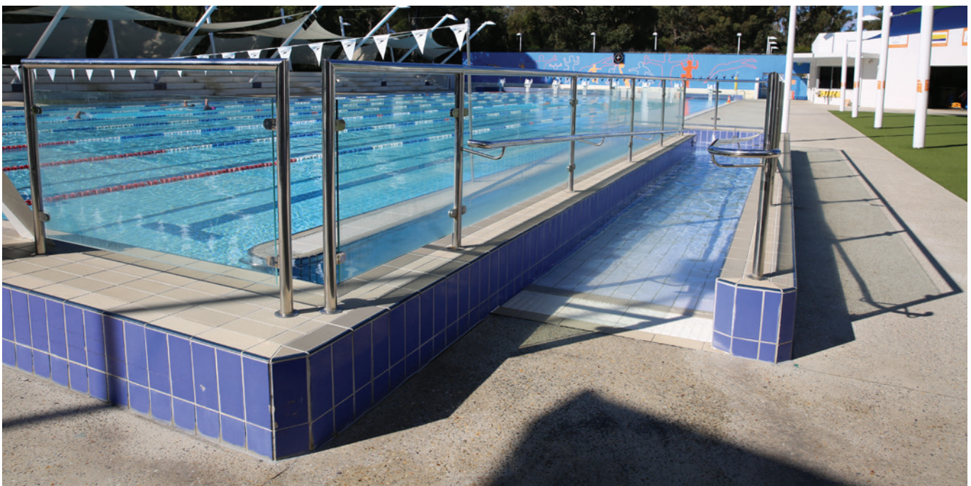
Accessible pool entry at Craigie Leisure Centre