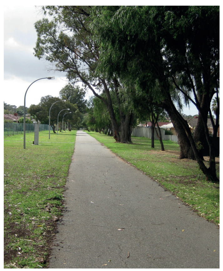
Current path layout along Robertson Road Cycleway.