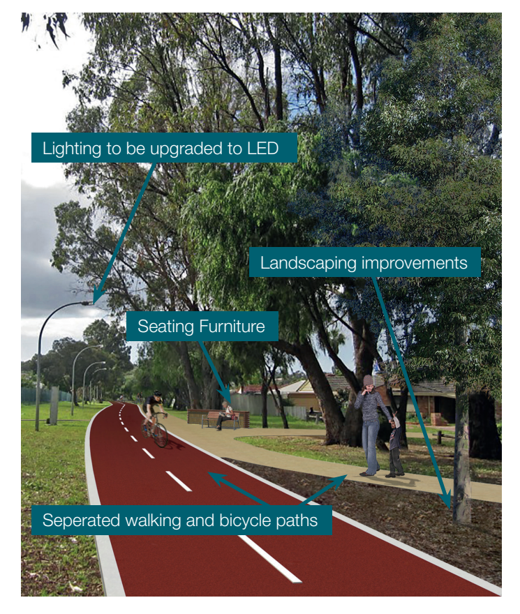
Aritst illustration of proposed upgrades along Robertson Road Cycleway.