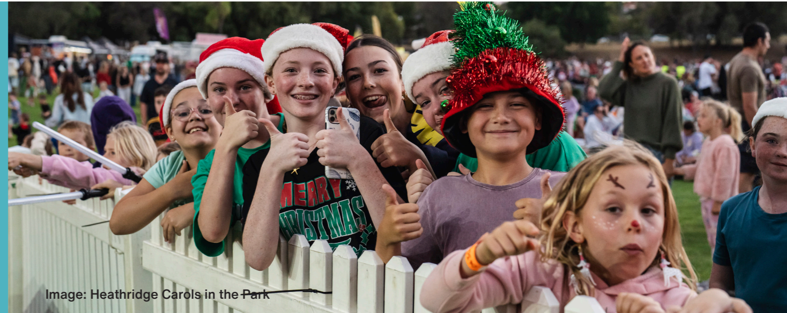
Image: Heathridge Carols in the Park

Applicants are ineligible for the Corporate Sponsorship Program if the application is for: