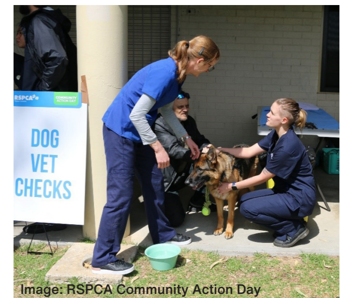
Image: RSPCA Community Action Day

For details about how the City handles personal information, and how to request access or correction, refer to the City's Collection Notice on the privacy webpage .