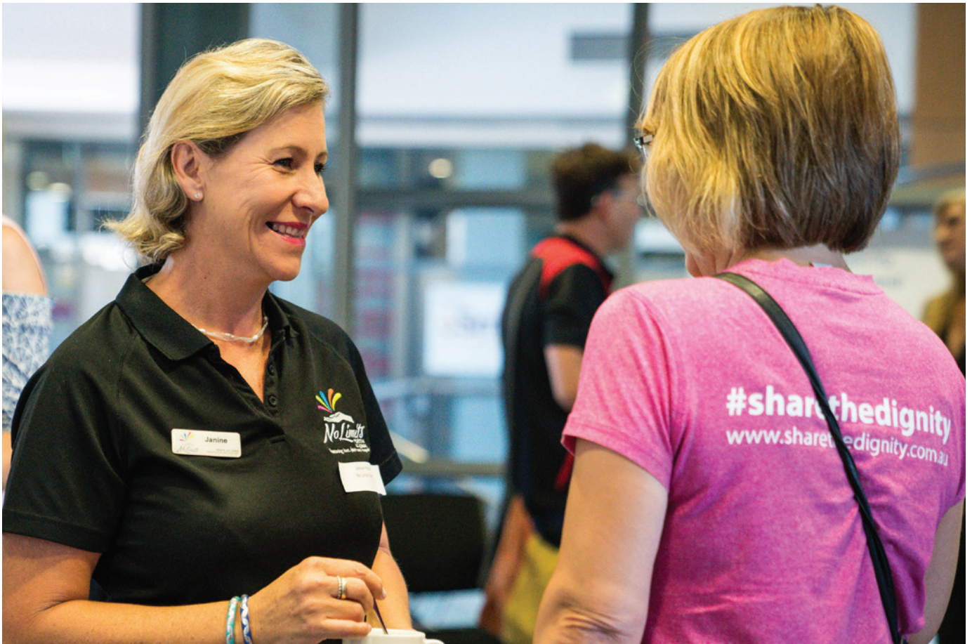
Regional Homelessness Plan 2018/19 – 2022 Launch