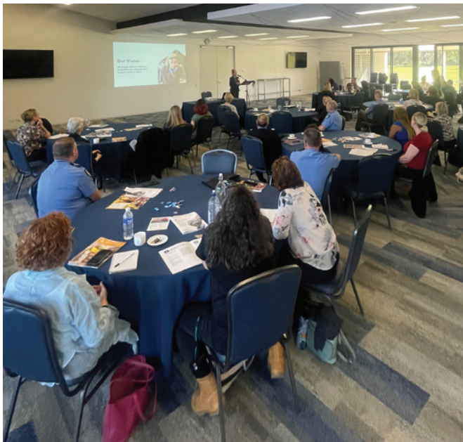
Regional Homelessness Networking Forum August 2021