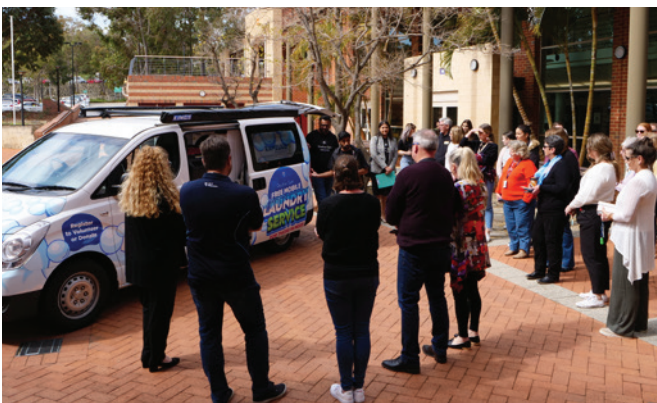
Launch of Positive Spin Mobile Laundry services, a collaboration between the Fortuna Foundation, No Limits and the Hepburn Centre.

The City's role in addressing homelessness will be one of coordination, support and advocacy in responding to homelessness in collaboration and partnership with the State and Federal Government, neighbouring local governments, homeless support services, community organisations and other relevant stakeholders to ensure that people experiencing homelessness are provided with effective and coordinated responses."