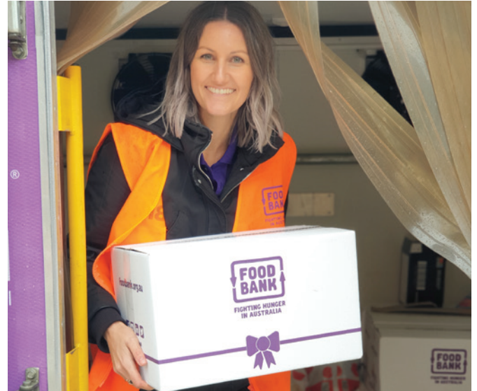
Foodbank volunteer at the mobile service co-located with Meal Connect and Australian Red Cross.

The City of Joondalup also has an internal protocol which guides staff on the process for reporting rough sleepers and how to engage with a person experiencing homelessness. Under the protocol, staff are provided training on understanding and responding to homelessness, and rough sleepers are offered information, support and referral if they are open to it.