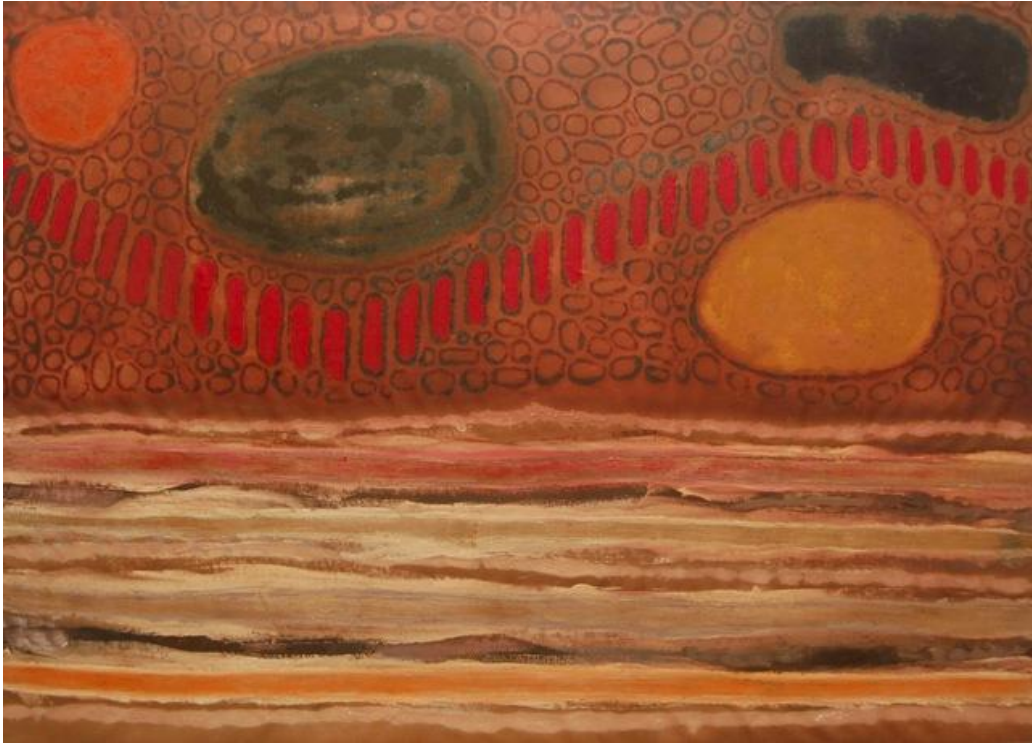
Moornong Boodja (My family my country out east,) (2010) resin, pigment & clay on hemp, 142 x 197cm