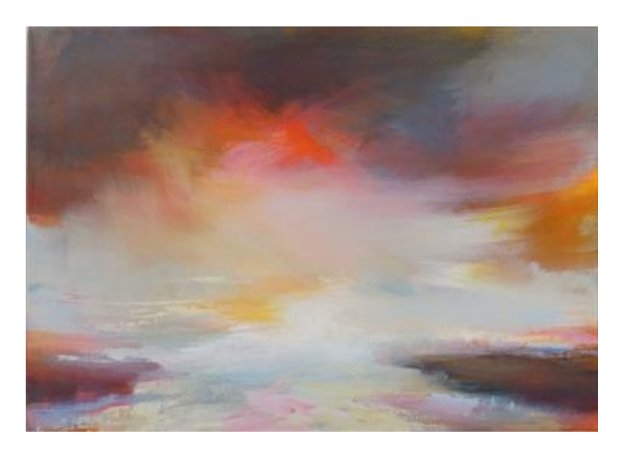
Coastal shore light Oil on canvas 50cm x 70cm