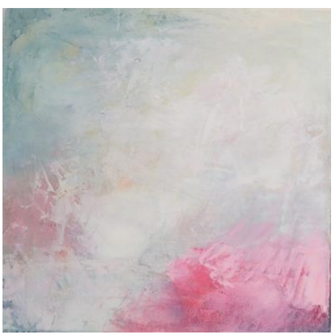
Rose light Oil on plaster on canvas 30cm x 30cm