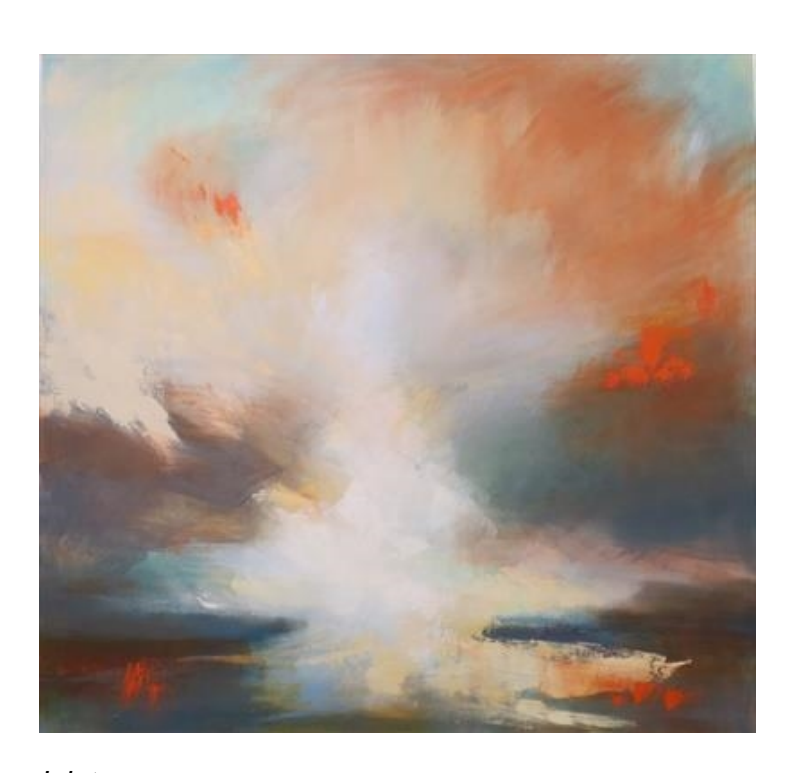
Inlet Oil on canvas 91cm x 91cm