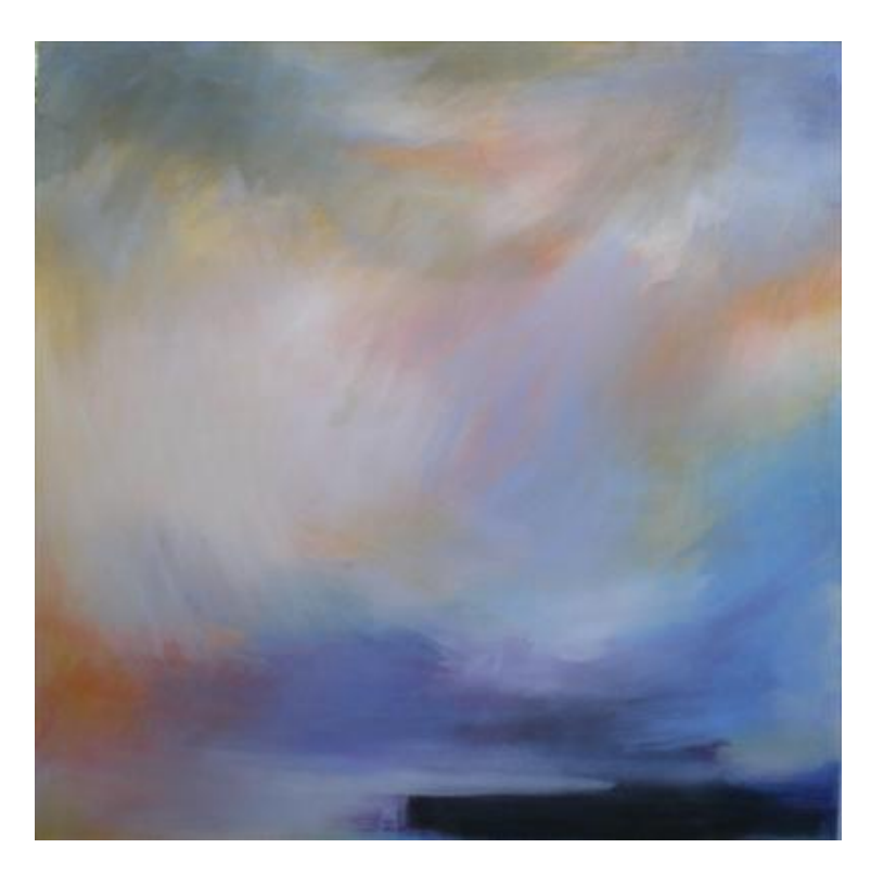
Ithican Skies (Looking to Kefalonia) Oil on canvas 91cm x 91 cm