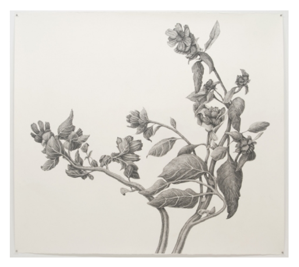
Untitled Ink on paper 2009