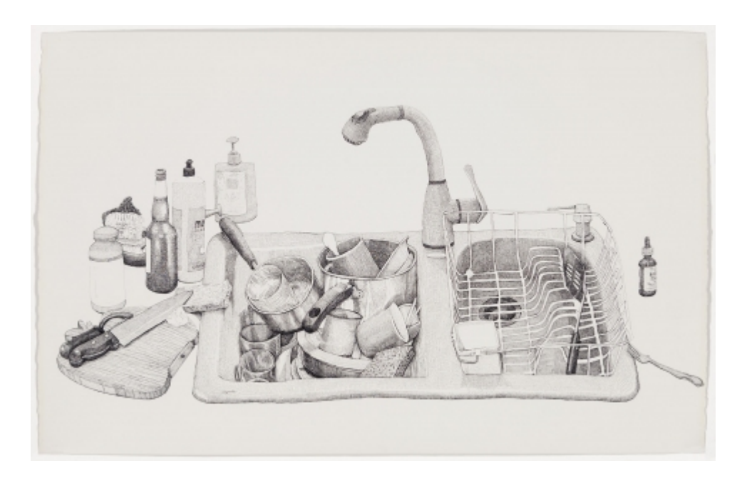
From the 'Two Years of drawing my Kitchen Sink' series Ink on paper 2011-13