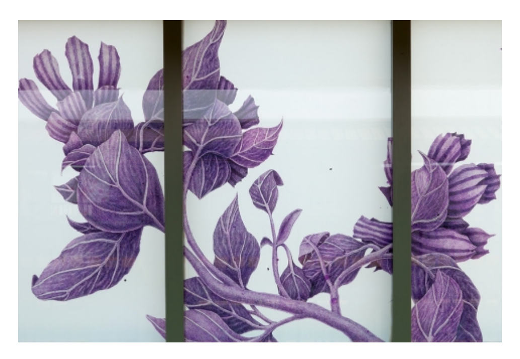
Panel from The Flora of Besonhurst Commissioned by the Metropolitan Transit Authority, NY 2012