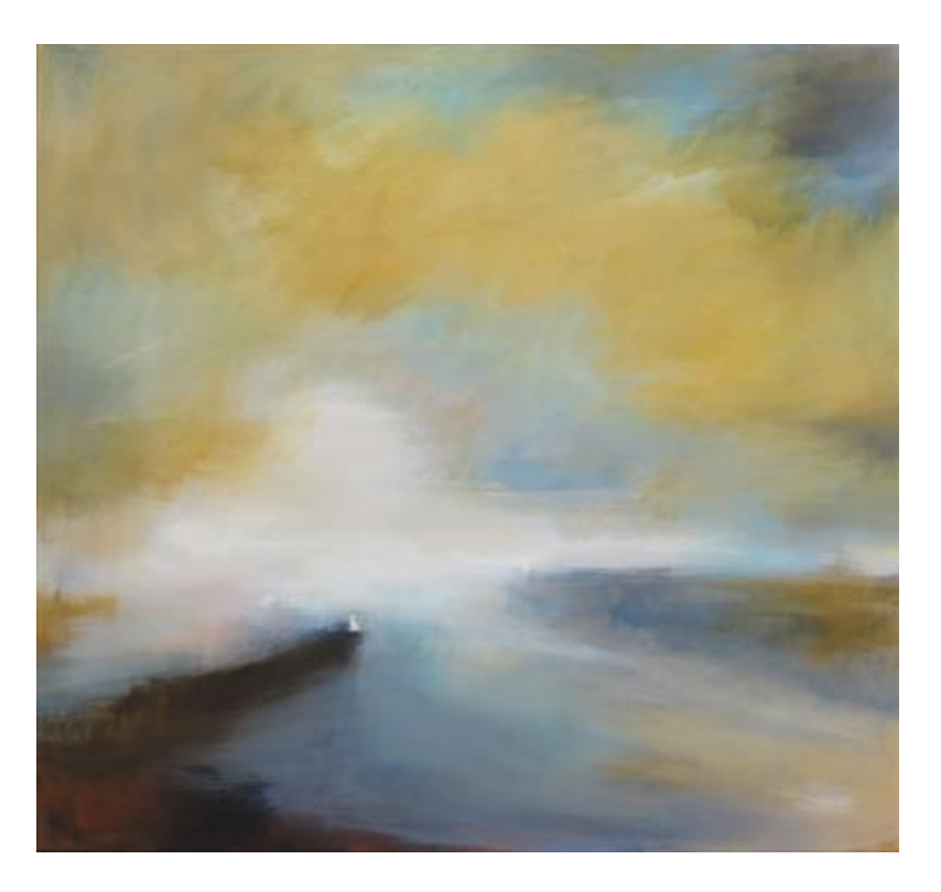
Distant Coastline Oil on canvas 91cm x 91cm