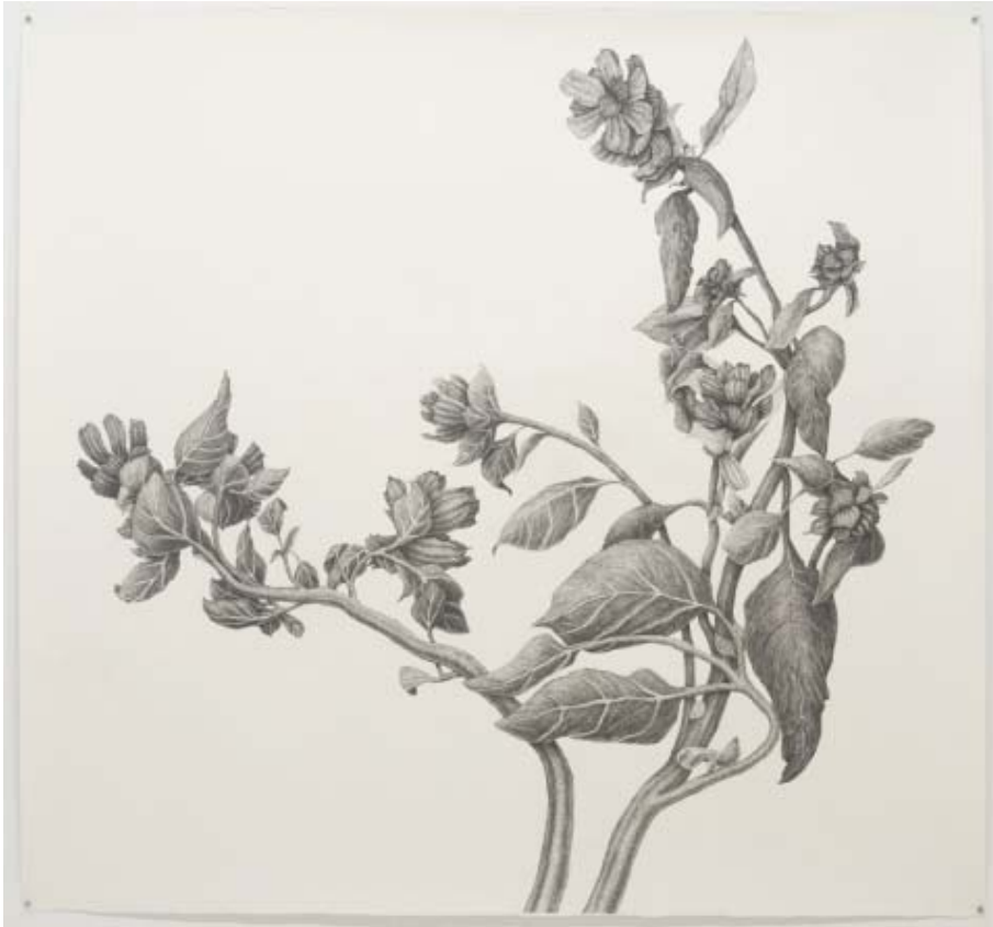
Untitled Ink on paper 2009