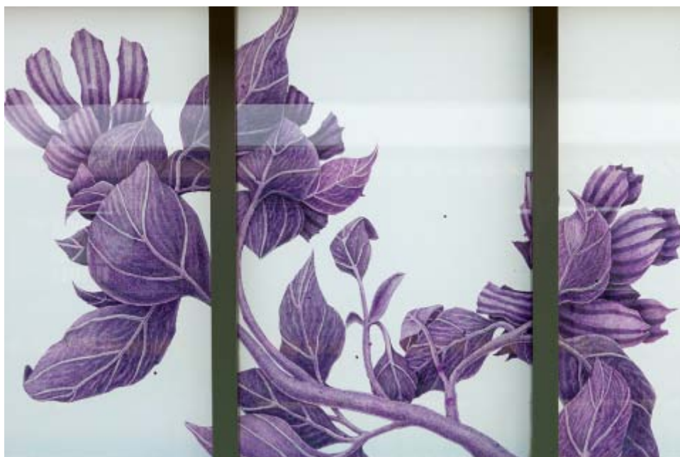
Panel from The Flora of Besonhurst Commissioned by the Metropolitan Transit Authority, NY 2012