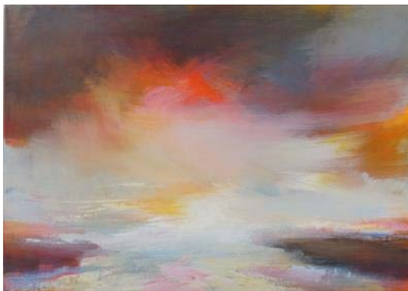
Coastal shore light Oil on canvas 50cm x 70cm