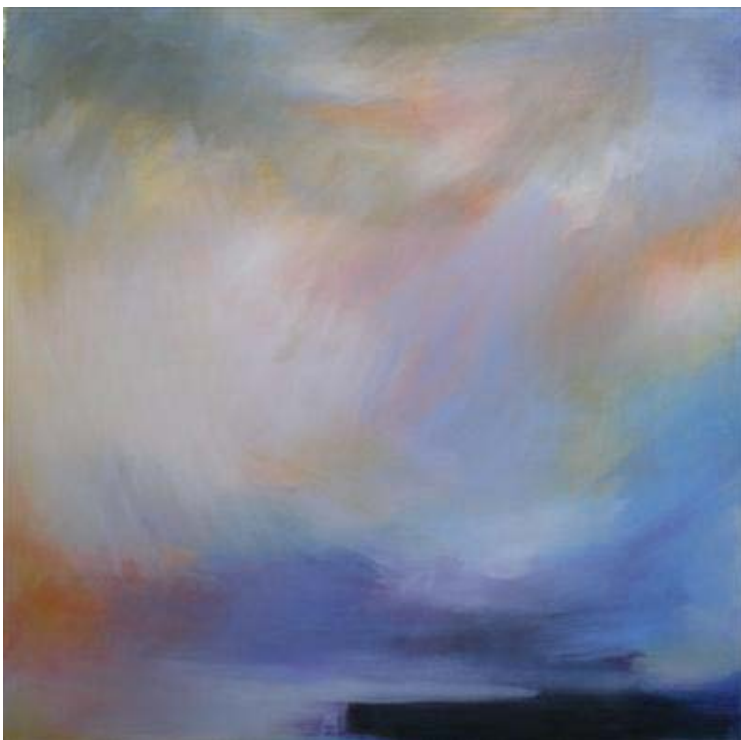
Ithican Skies (Looking to Kefalonia)