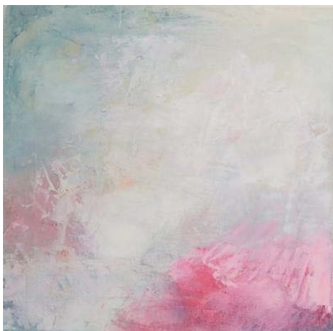
Rose light Oil on plaster on canvas 30cm x 30cm