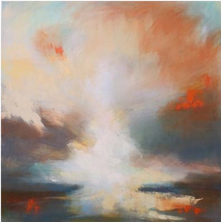
Inlet Oil on canvas 91cm x 91cm