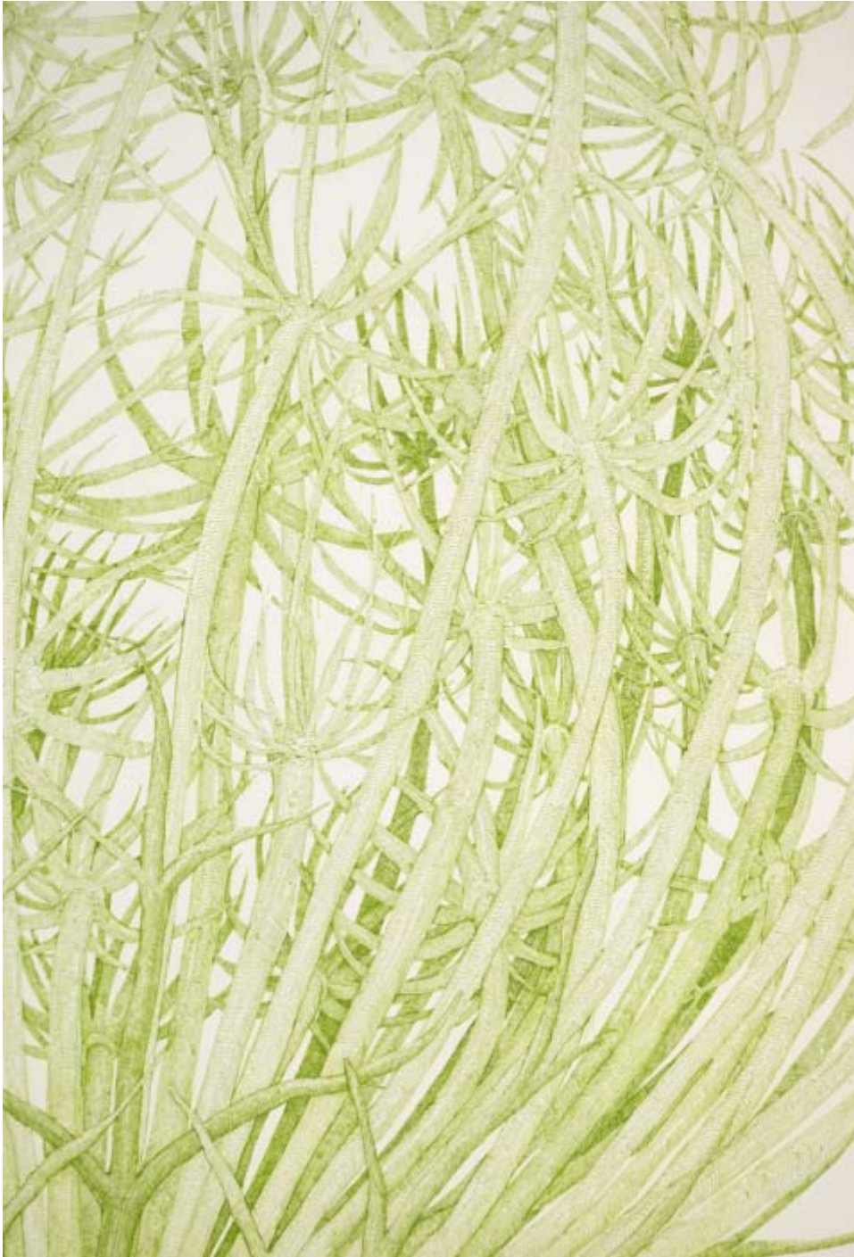
Green weed Ink on paper 2010