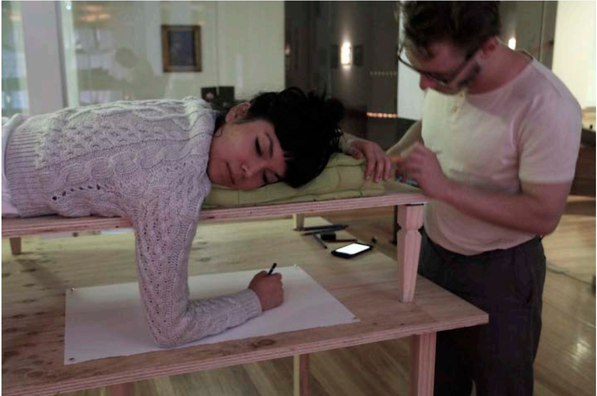
Participatory drawing (documentation) Canberra, 2013