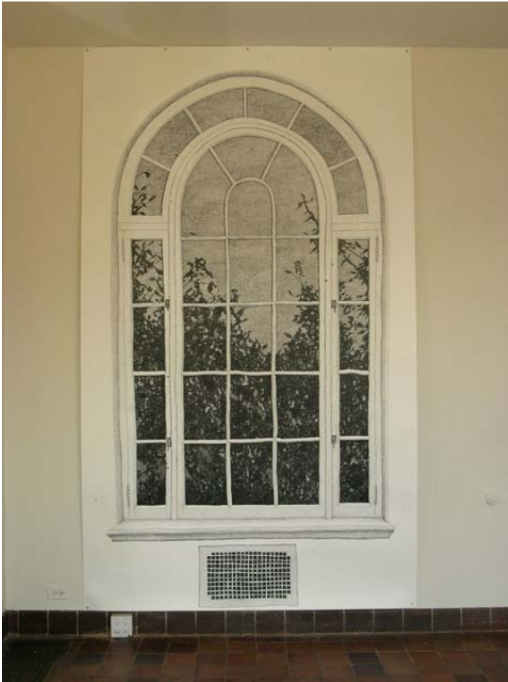
Untitled site-specific drawing Mixed media on paper 2010