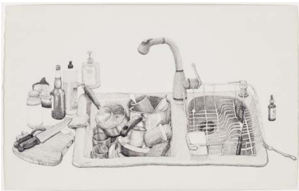
From the ' Two Years of drawing my Kitchen Sink ' series Ink on paper 2011-13