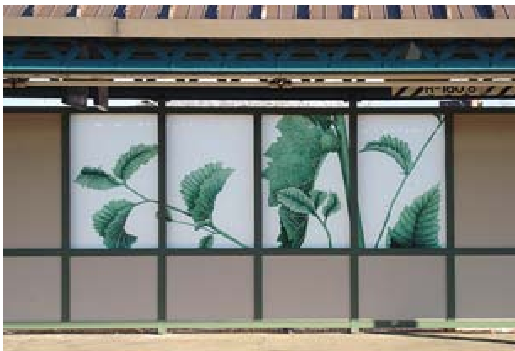
Panel from The Flora of Bensonhurst Commissioned by the Metropolitan Transit Authority, NY 2012