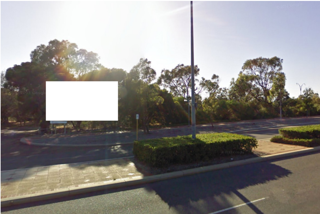
View of proposed billboard situated on North West corner, facing North West.