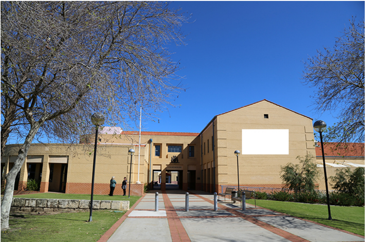
A wall based custom billboard could be installed on the Courthouse East facing wall however a window would need to be permanently blocked off.