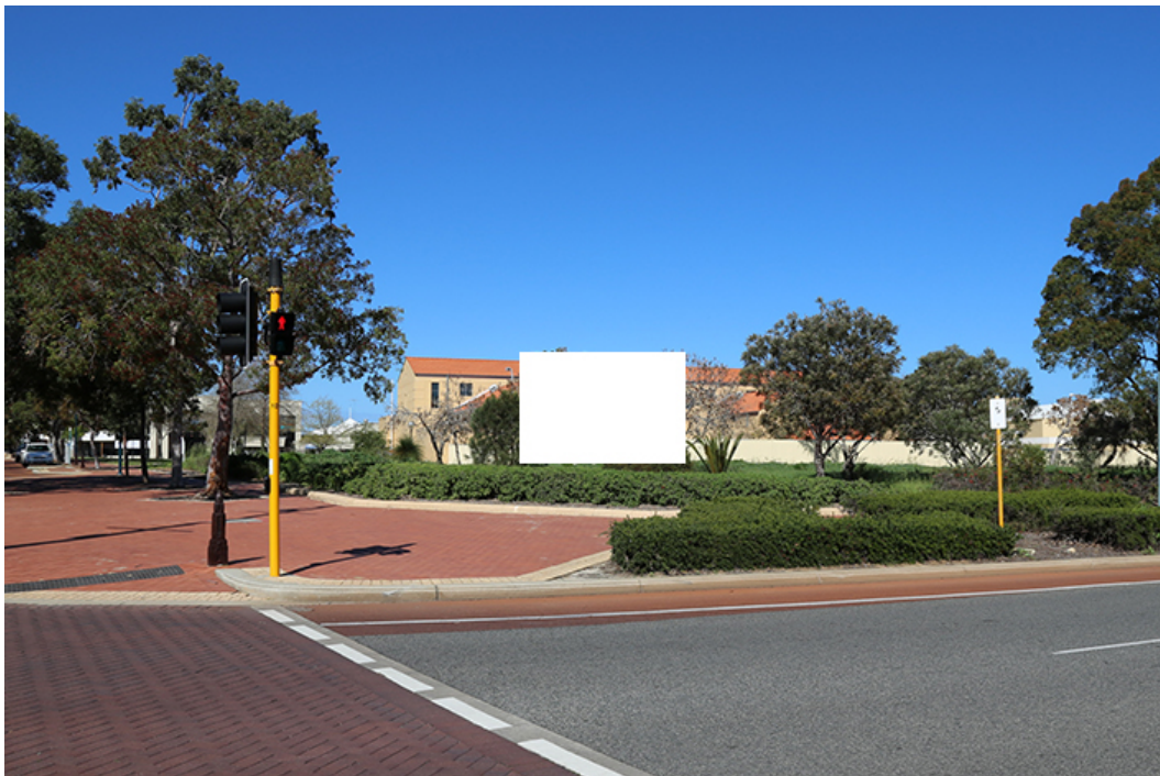
View of proposed billboard situated on the South West corner of Shenton Avenue and Grand Boulevard, facing North East.