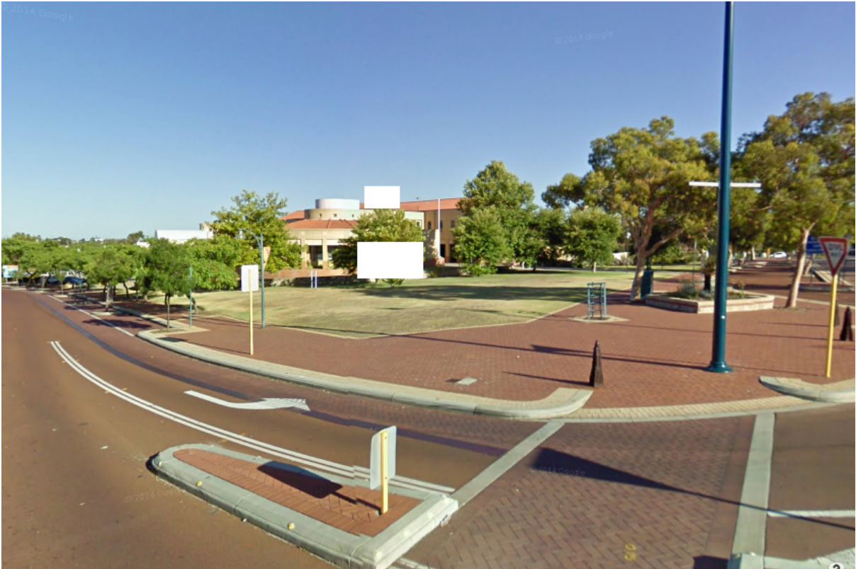
View of proposed billboard positions on the Courthouse front lawn and roof. Due to the nature of the building, a rooftop billboard would need to be custom built.