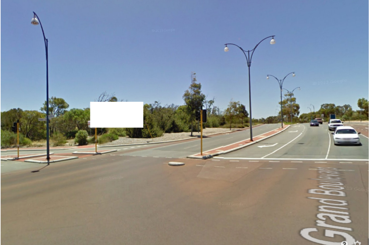
View of proposed billboard situated on the North West corner, facing South East across from the main entrance to ECU.