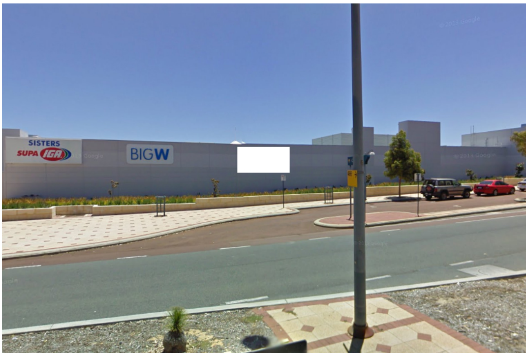
Proposed view of a wall mounted billboard on Lakeside Joondalup Shopping City building, facing East on Grand Boulevard.