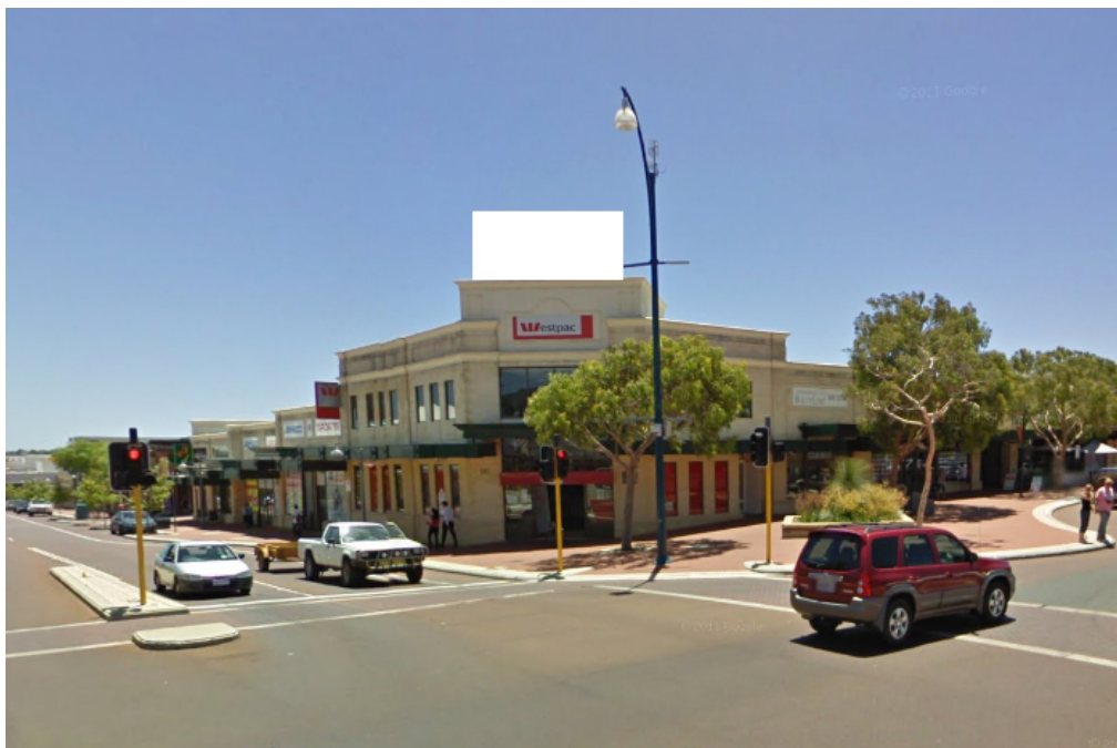
View of proposed billboard on the roof of 140 Grand Boulevard, above Westpac