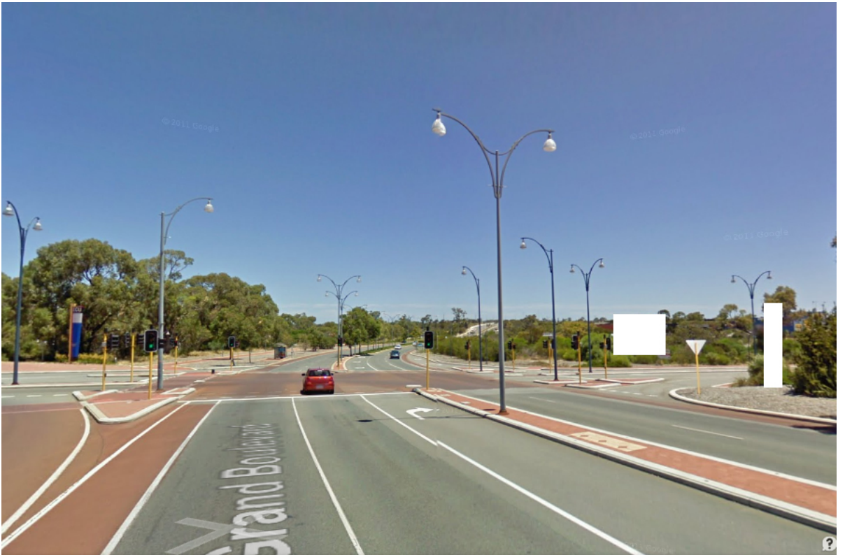
View of proposed billboard situated on the South West corner, facing North East (also showing a side view of the billboard on the North West Corner facing South East).