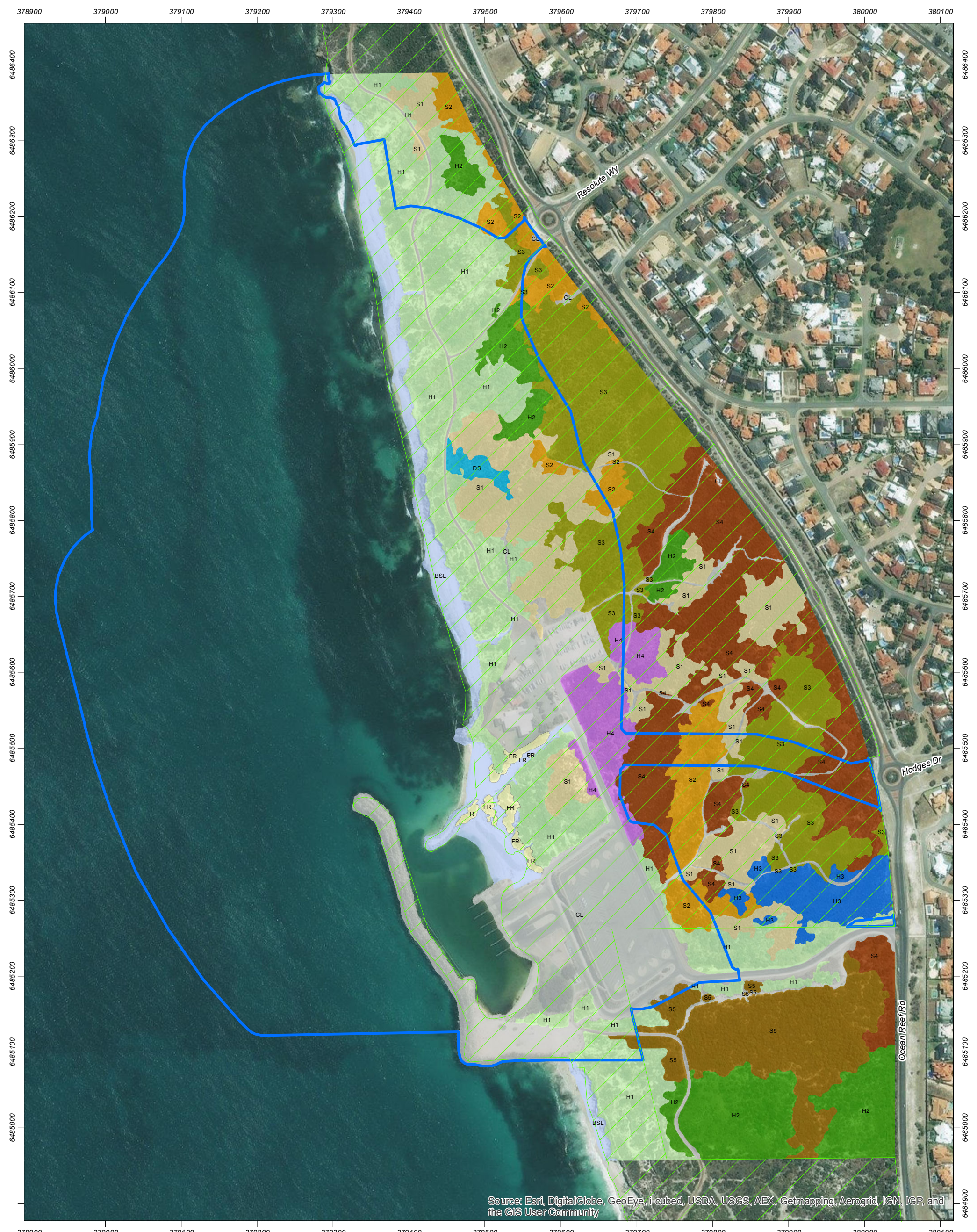
Figure 1 Ocean Reef Marina Development vegetation type

Scale 1:4,655 at A3 0 50 100 150 m Coordinate System: GDA 1994 MGA Zone 50 Note that positional errors may occur in some areas Date: 29/01/2015 Author: JCrute