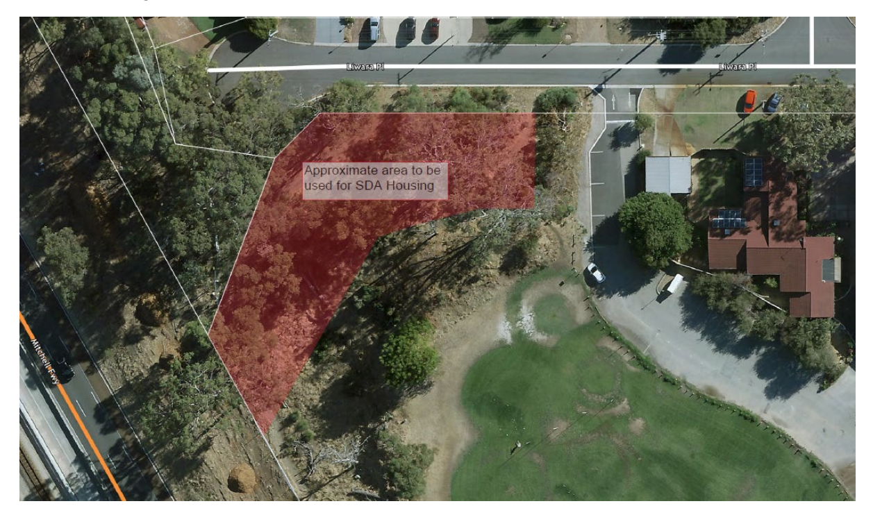
Figure 2 – Proposed SDA Site Location

There is an undeveloped and under-utilised portion of the site of approximately 1,530m<sup>2</sup> located in the north western corner fronting Liwara Place and the Mitchell Freeway as depicted in Figure 2 below.