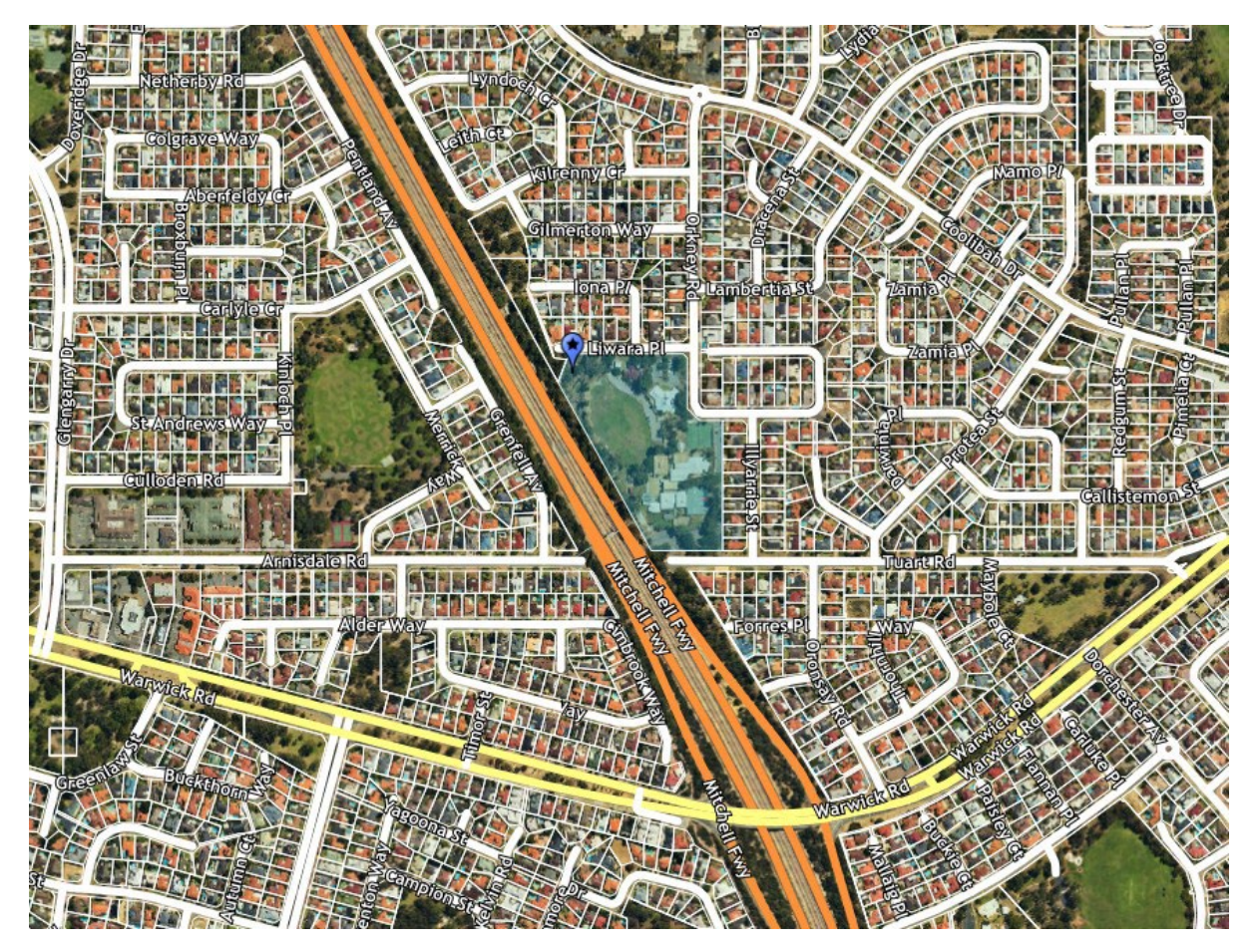
Figure 1 – Location Plan

Lot 847 Tuart Road, Greenwood ("the subject land") is a 4.7ha parcel of land located on the eastern side of the Mitchell Freeway in the suburb of Greenwood. A location plan is Figure 1.