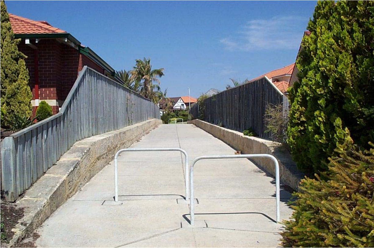
PHOTOGRAPH TAKEN FROM THE MASCOT COURT END OF THE PEDESTRIAN ACCESSWAY