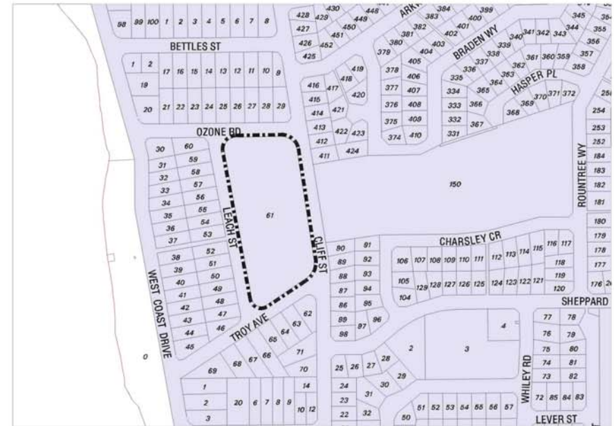
EXISTING RESIDENTIAL DENSITY CODE