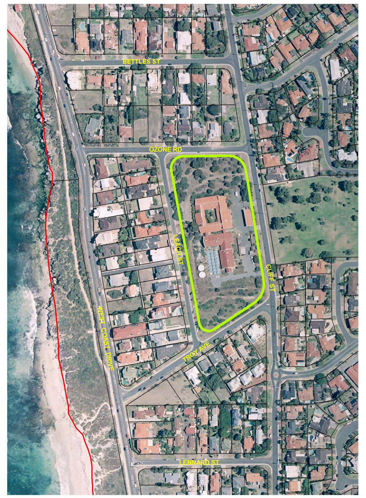
Digital Photography : DLI December 2004 Prepared by City of Joondalup : Urban Design & Policy, Cartographic Section. 08032006 - djt