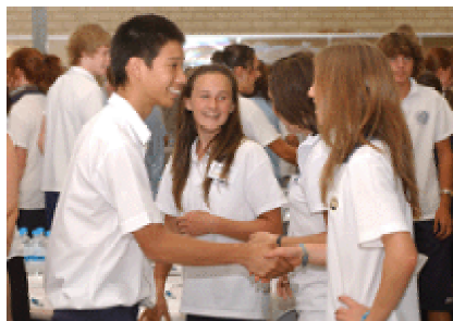
Young people engage in an 'Ice breaker' welcome activity