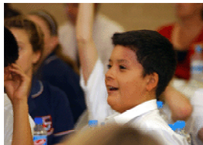
A Youth Forum participant is eager to have his say in the discussion