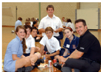
Mayor Troy Pickard joins a group of young people for lunch and a chat