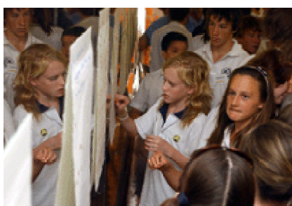
Students vote on the issues they most want to have a say in