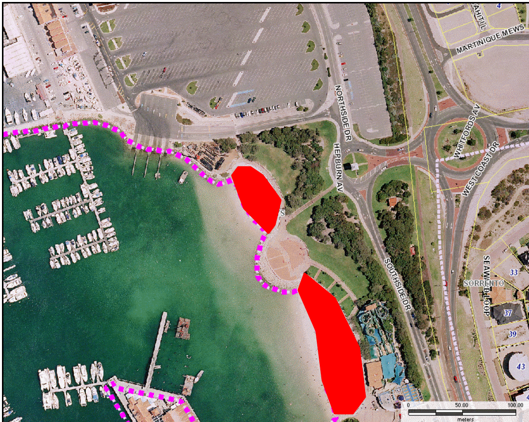
Diagram 1 – Hillarys Marina Beach