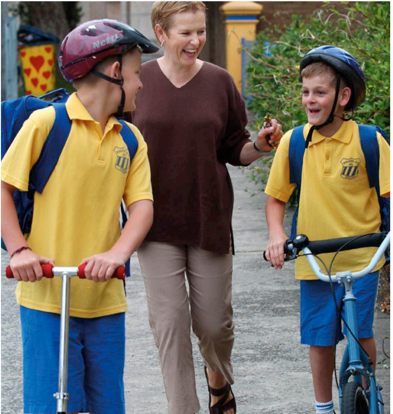
Walking School Bus