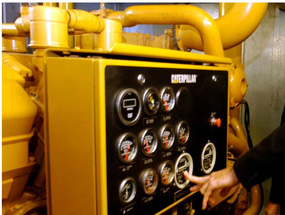
Tamala Park Landfill Gas Recovery Plant

This Greenhouse Action Plan 2007 – 2010 will need to be resourced, monitored and reviewed regularly to assist the City and its community to meet its 2010 greenhouse gas emissions reduction goal.