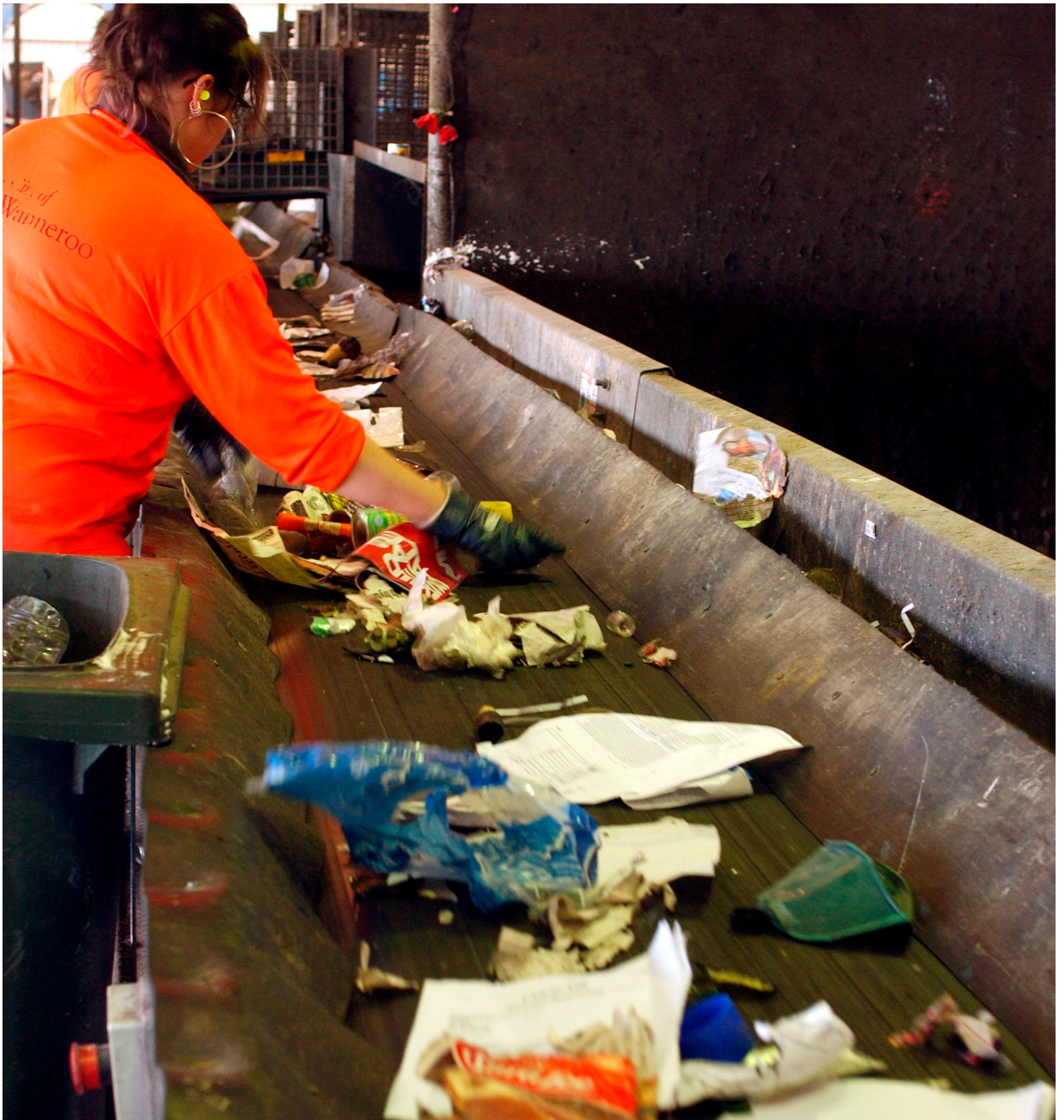
Materials Recycling Facility - Wangara