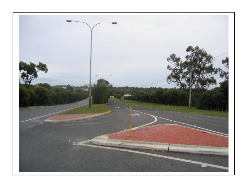
Typical "Seagull" island treatment

A preliminary investigation shows that it is likely that no changes would be required to the existing kerb lines.