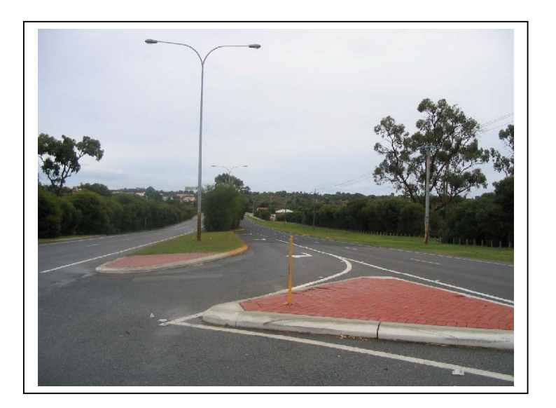
Typical "Seagull" island treatment

A preliminary investigation shows that it is likely that no changes would be required to the existing kerb lines.