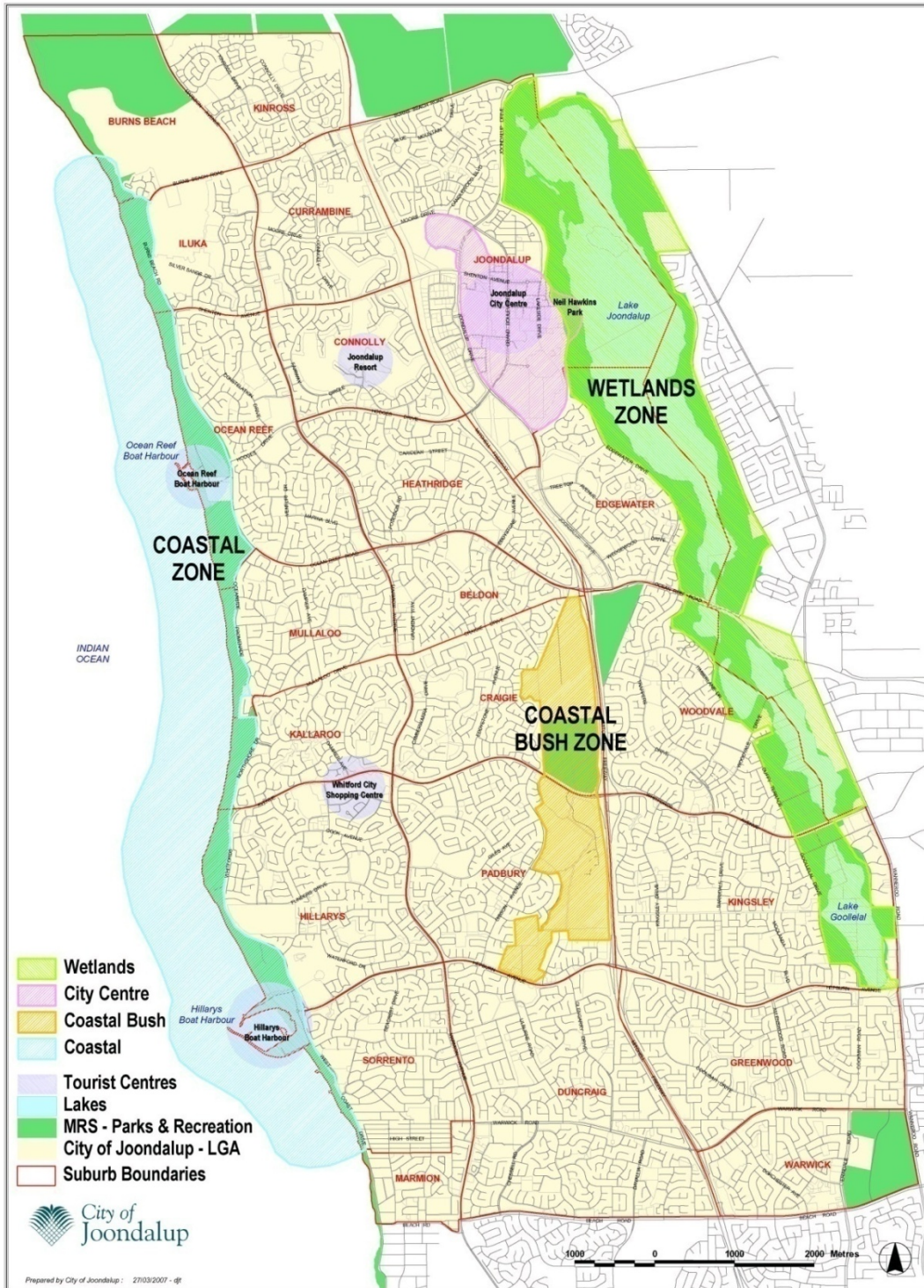
Figure 1. The Biodiversity Zones of the City of Joondalup

important area for aquatic recreation. The Park is an A class reserve and has outstanding conservation significance. It is an important habitat for a diverse range of marine life; seabird communities, marine mammals such as the bottlenose dolphin and Australian sealions, an array of fish species, colourful invertebrates, sea floor communities including seagrass meadows, algal limestone pavement communities and crevice animal associations. The Park waters are also known to be a migratory path for humpback whales.