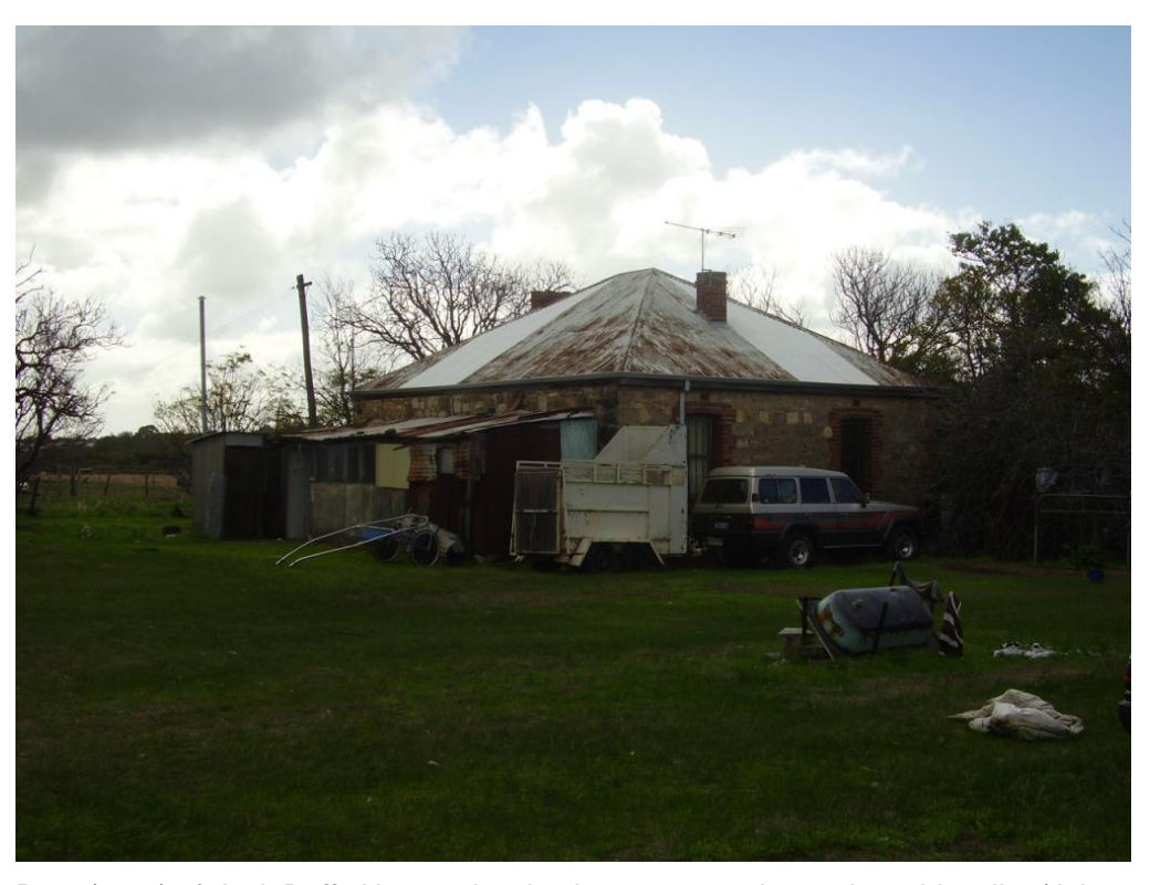
Rear (west) of Jack Duffy House, showing lean-to extension and outside toilet (July 2009)