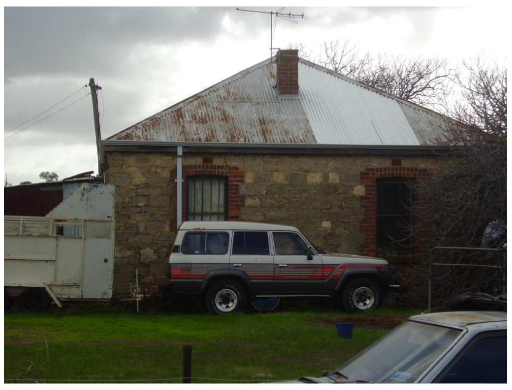
South façade of Jack Duffy House, showing quoining at windows (July 2009)