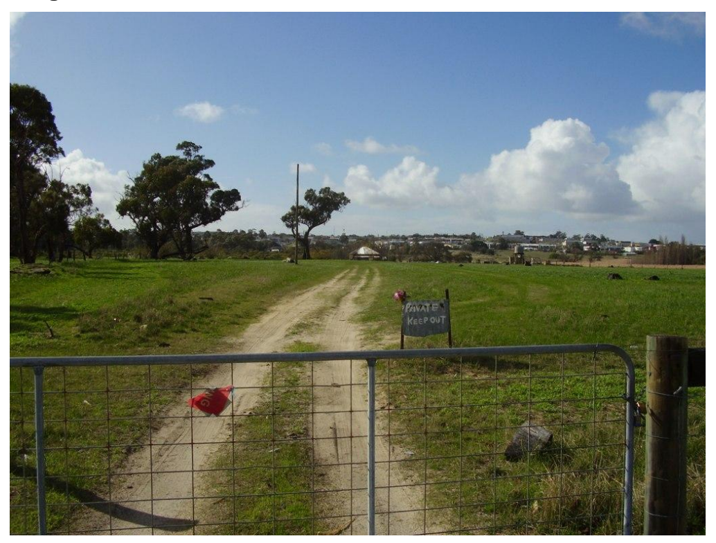
Entrance to Jack Duffy House from Duffy Terrace (July 2009)