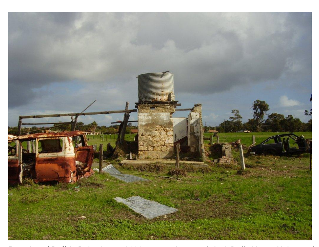
Remains of Duffy's Dairy, located 100m to south-west of Jack Duffy House (July 2009)