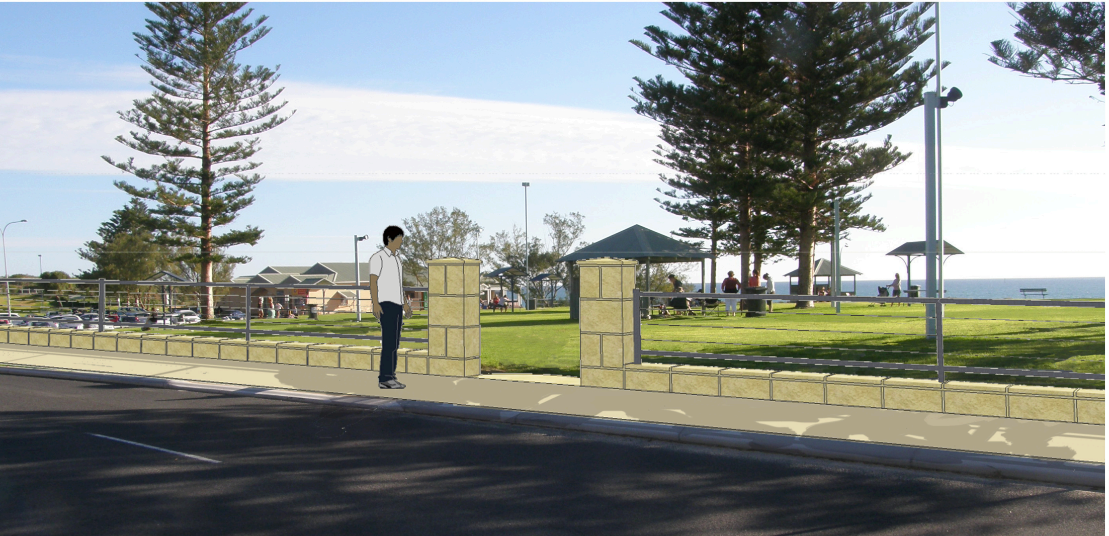
TOM SIMPSON PARK, MULLALOO