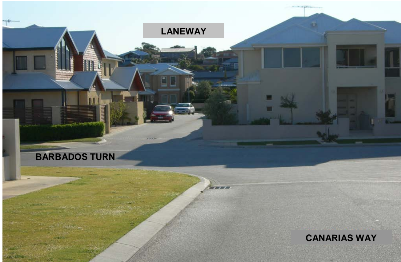
LANEWAY VIEWED FROM WEST TO EAST SHOWING OFFSET ALIGNMENT WITH CANARIAS WAY