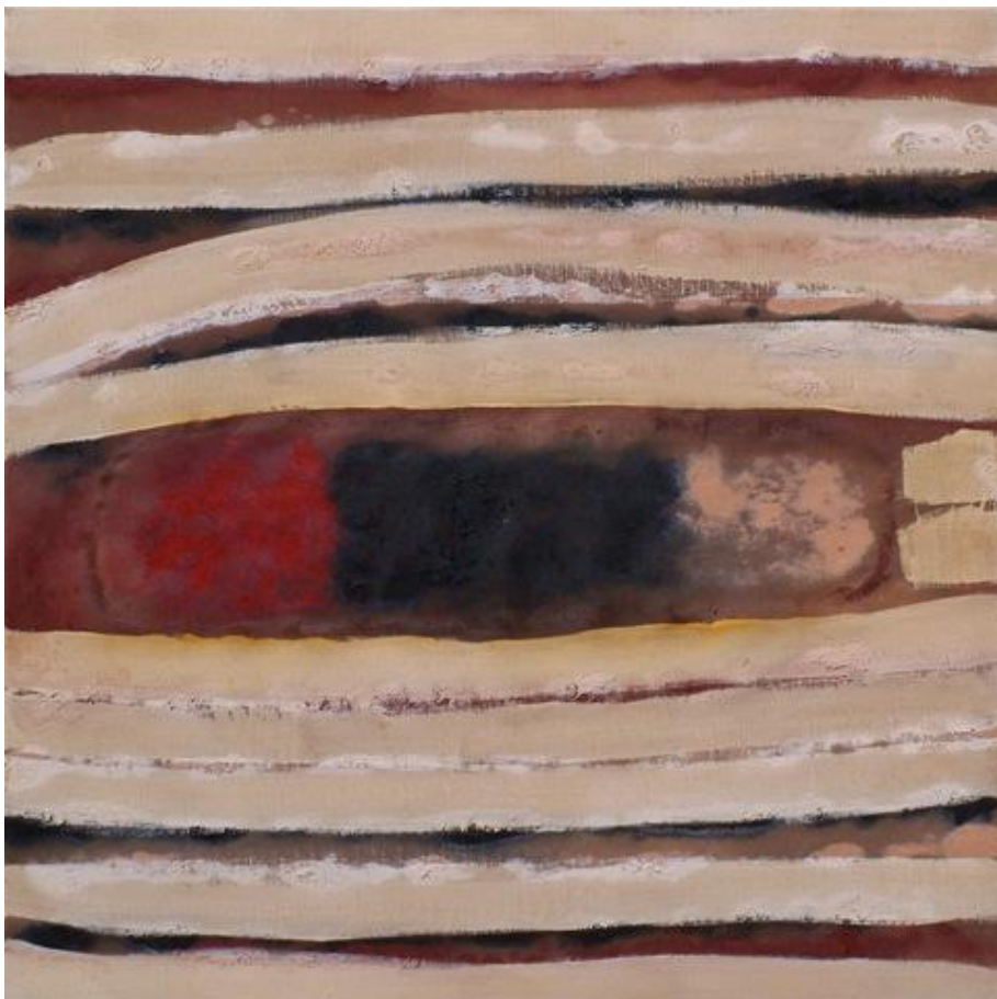
Karlbeedal (Hot coals of the fire) , (2011) resin, pigment & clay on hemp, 100 x 100cm