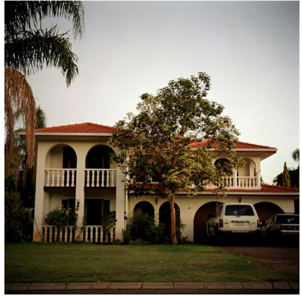
No 12-14 (2004) pigment print 80 x 80 cm, 80 x 80cm