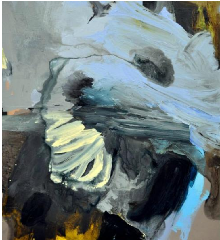
Feeling for Turtle (2011) acrylic on canvas 152 x 137 cm