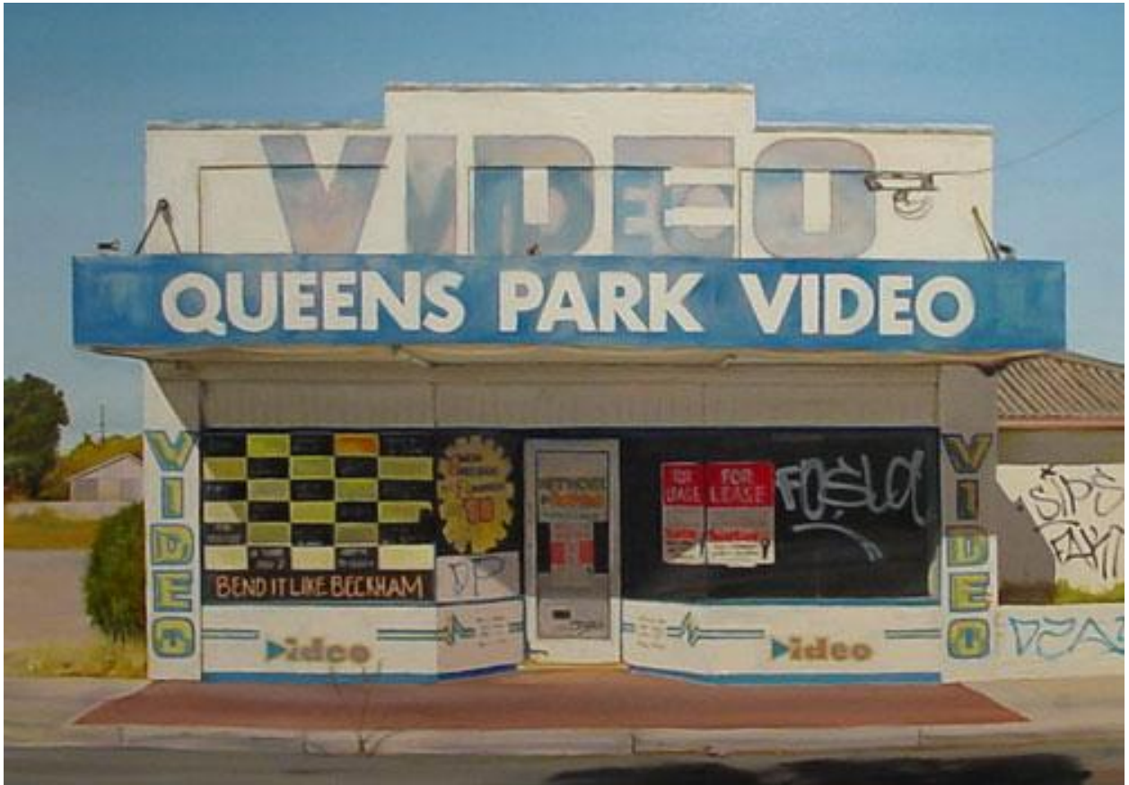
queens park video (2006) oil on linen