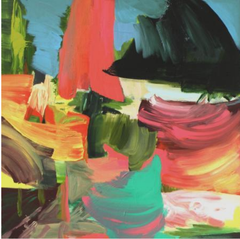
Retinal Assault of the Western Sun (2009) oil & enamel on canvas 152 x 152 cm