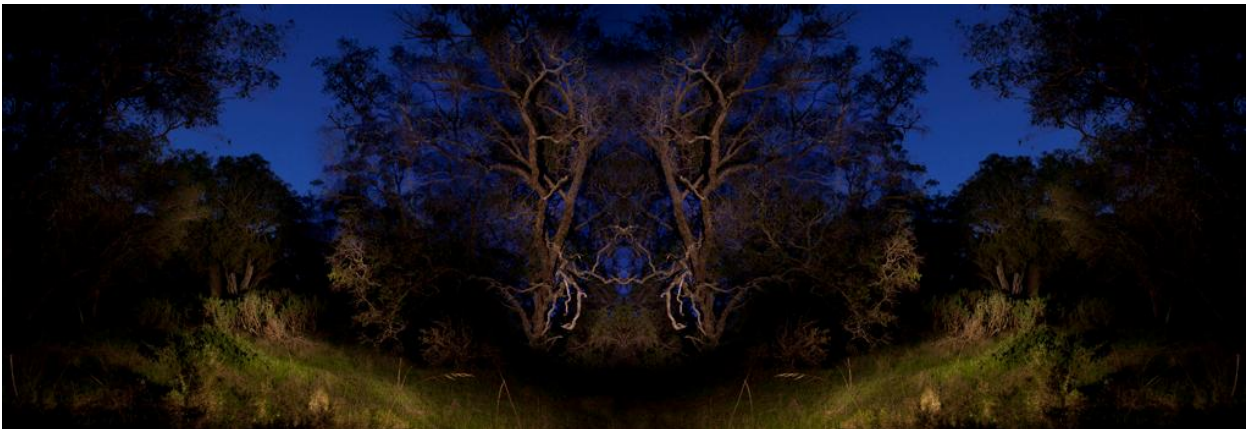
There is unrest in the forest; there is trouble in the trees #5 (2010-2011) pigment print 62 x 180cm