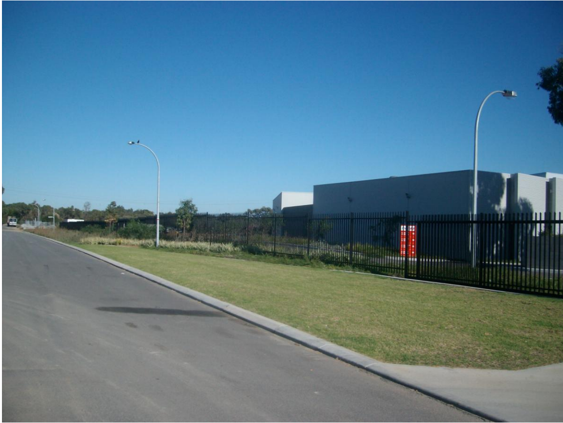
Existing fencing to the southern boundary (Injune Way)