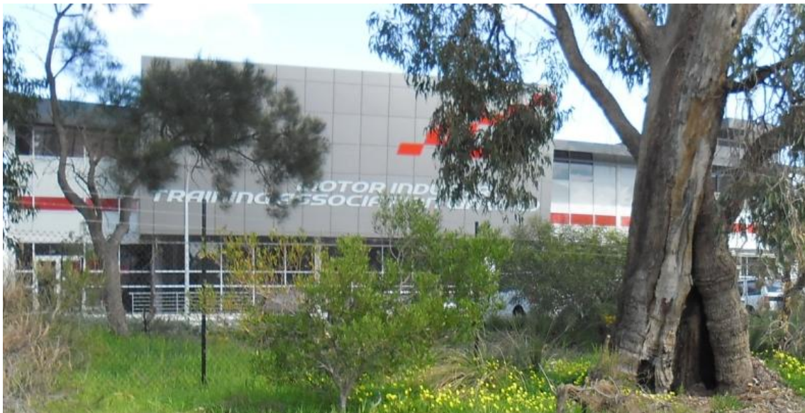
Existing chain mesh fencing to Joondalup Drive frontage