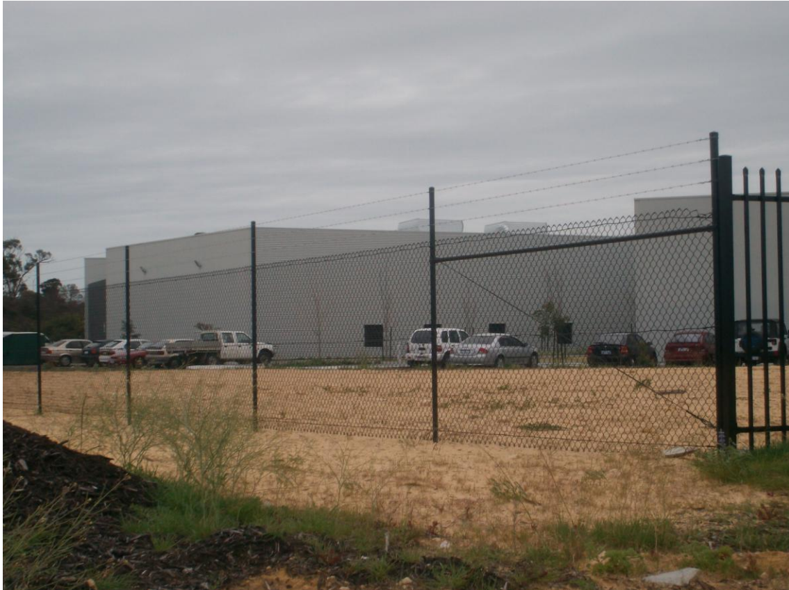
Existing chain mesh fence to rear boundary, consistent with Joondalup Drive fencing