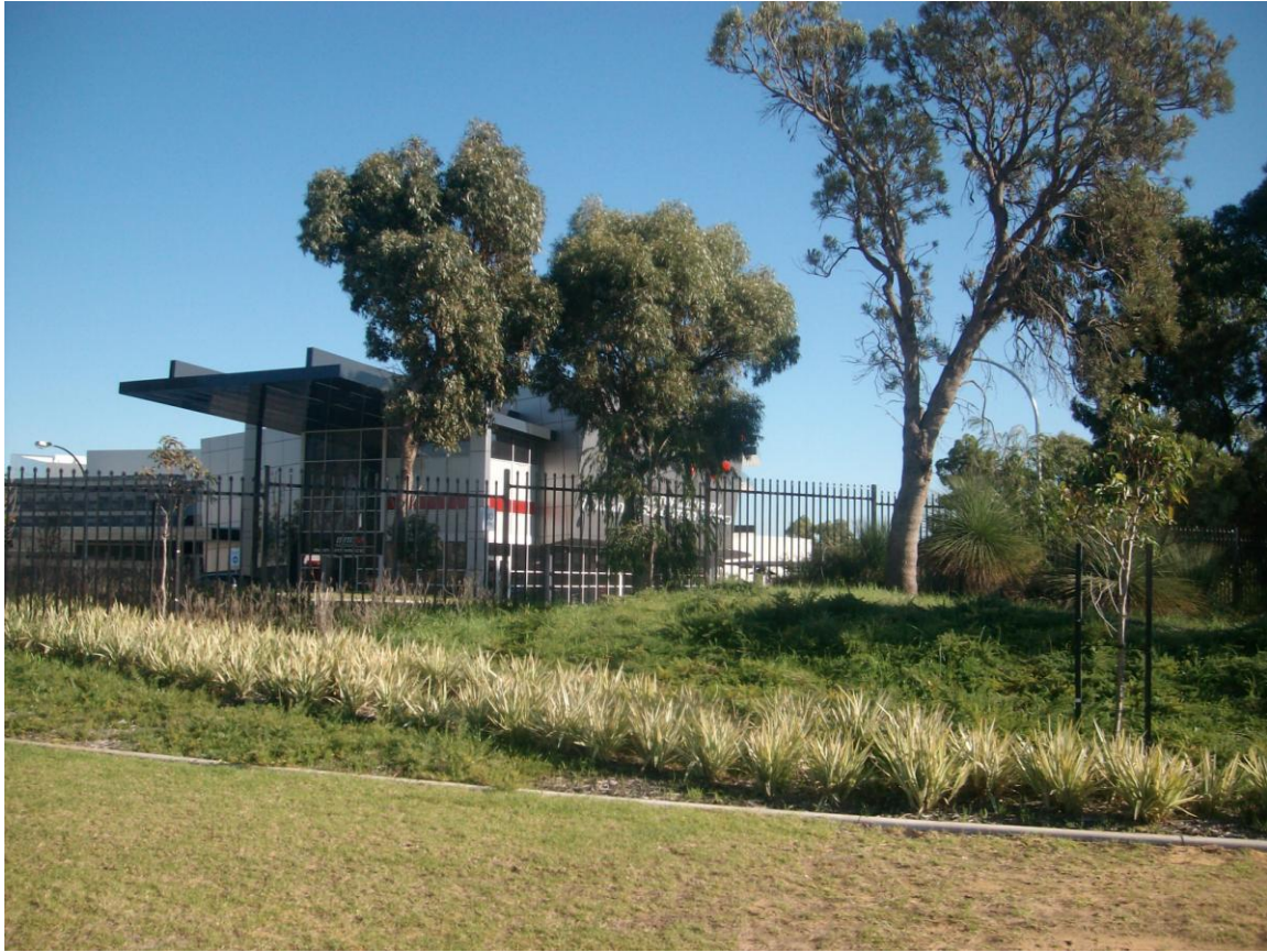
Existing fencing to the south-eastern boundary (Truncation)