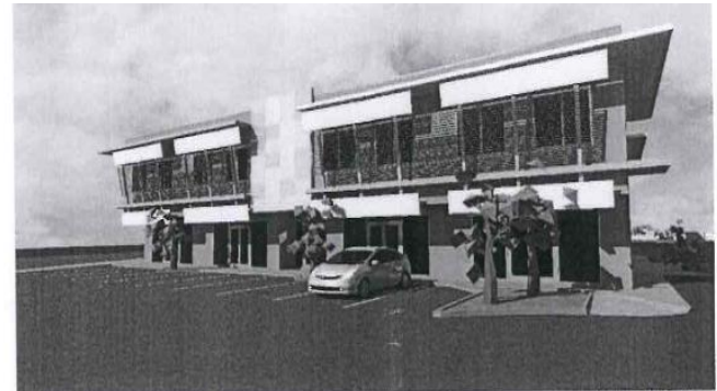
EAST PERSPECTIVE VIEW