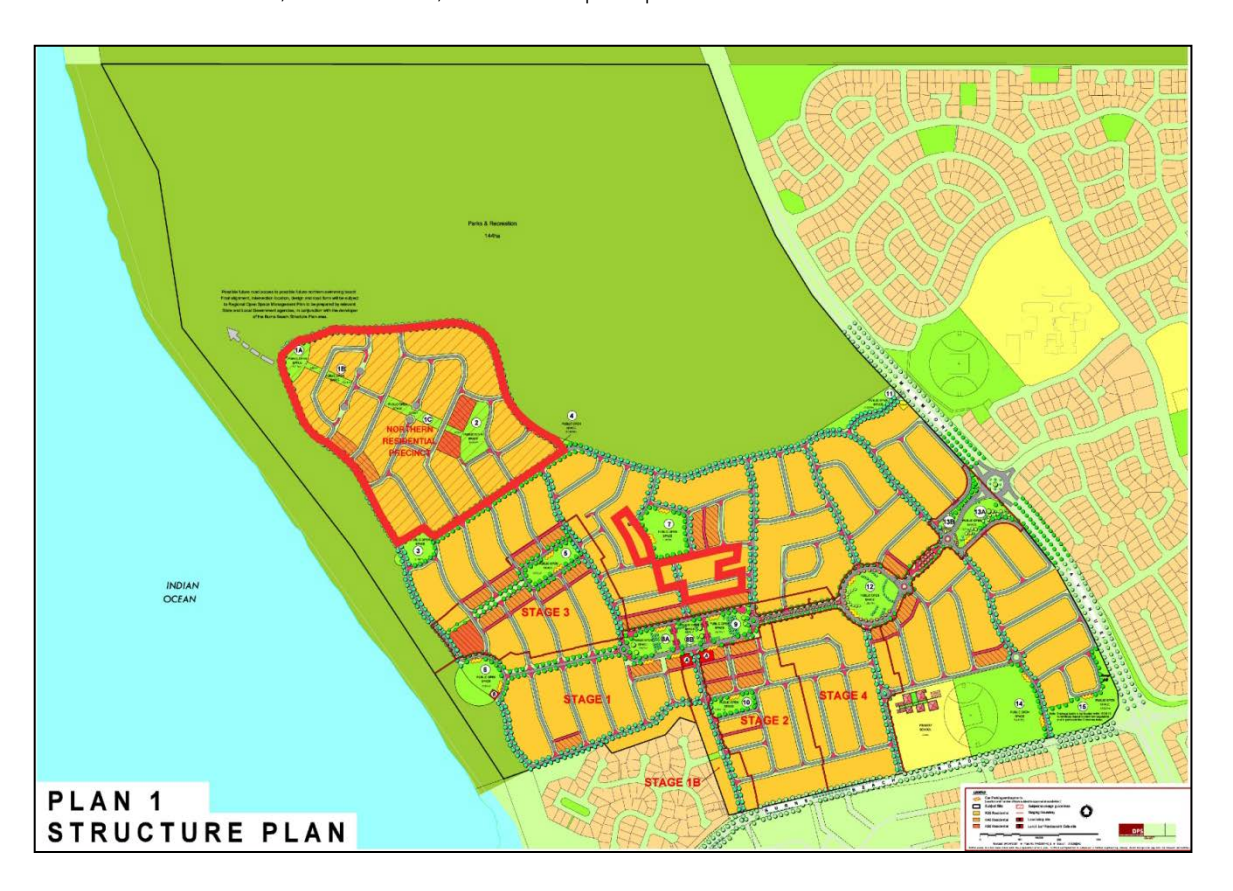
Figure 1 – Approved Burns Beach Strucutre Plan and extent of proposed Amendment

The subject site(s) are located within Burns Beach Estate, approximately 4.7 kilometres north-west of the Joondalup City Centre within the City of Joondalup. The site abuts existing unconstructed residential allotments to the south, west and east, and Public Open Space to the north of the site.