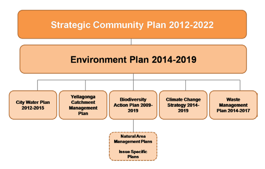
Figure 1- City of Joondalup Environmental Framework

Sitting below the draft Environment Plan 2014-2019 are a series of issue specific plans which address key environmental issues such as water conservation, climate change and adaptation and biodiversity conservation. These issue-specific plans contain detailed information on the activities that the City will take in addressing the key environmental issues affecting the local environment.