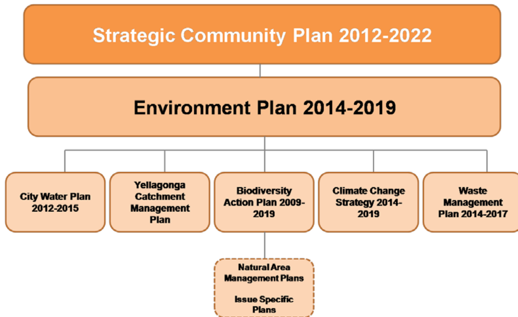
Figure 1- City of Joondalup Environmental Framework

Sitting below the draft Environment Plan 2014-2019 are a series of issue specific plans which address key environmental issues such as water conservation, climate change and adaptation and biodiversity conservation. These issue-specific plans contain detailed information on the activities that the City will take in addressing the key environmental issues affecting the local environment.