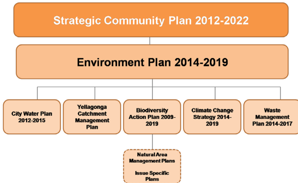
Figure 1- City of Joondalup Environmental Framework

Sitting below the draft Environment Plan 2014-2019 are a series of issue specific plans which address key environmental issues such as water conservation, climate change and adaptation and biodiversity conservation. These issue-specific plans contain detailed information on the activities that the City will take in addressing the key environmental issues affecting the local environment.