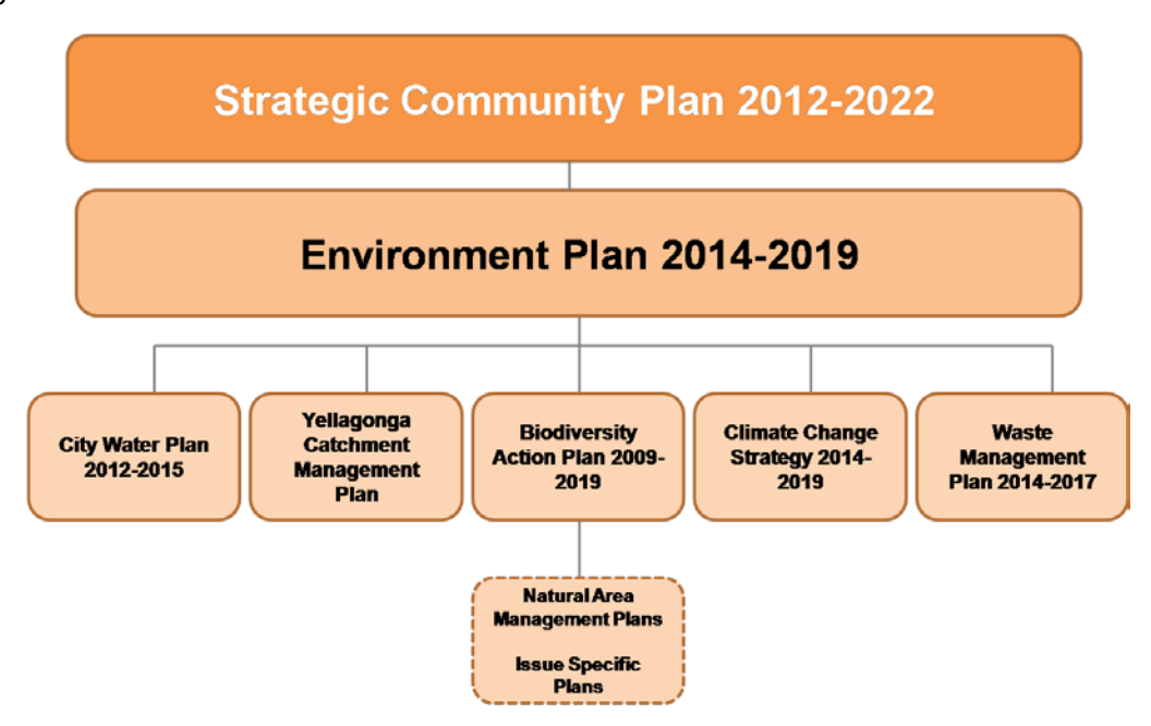
Figure 1: City of Joondalup Environmental Framework

Achievement of the objectives within the Environment P lan 2014 -2019 will be supported through the City's Environmental Framework, shown in Figure 1. The City's Environmental Framework provides high level guidance to the management of the local environment. The Environment P lan 201 4-2019 sets the strategic direction for the City's environmental management activities.