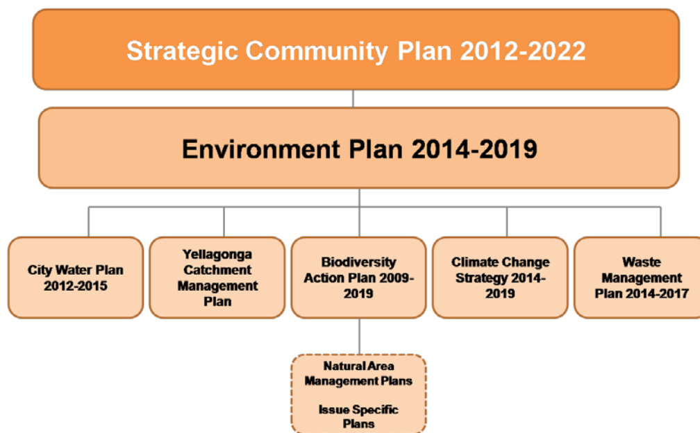
Figure 1: City of Joondalup Environmental Framework

Achievement of the objectives within the Environment Plan 2014-2019 will be supported through the City’s Environmental Framework, shown in Figure 1. The City’s Environmental Framework provides high level guidance to the management of the local environment. The Environment Plan 2014-2019 sets the strategic direction for the City’s environmental management activities.