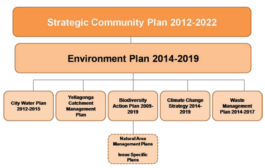
Figure 1: City of Joondalup Environmental Framework

Achievement of the objectives within the Environment Plan 2014-2019 will be supported through the City's Environmental Framework, shown in Figure 1. The City's Environmental Framework provides high level guidance to the management of the local environment. The Environment Plan 2014-2019 sets the strategic direction for the City's environmental management activities.