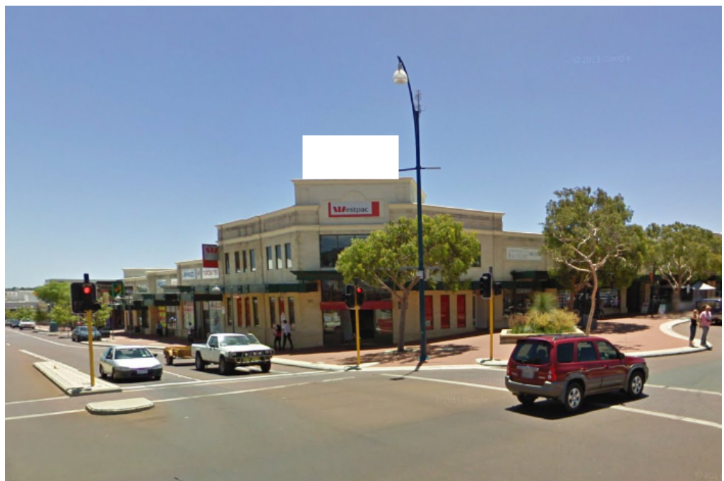
View of proposed billboard on the roof of 140 Grand Boulevard, above Westpac