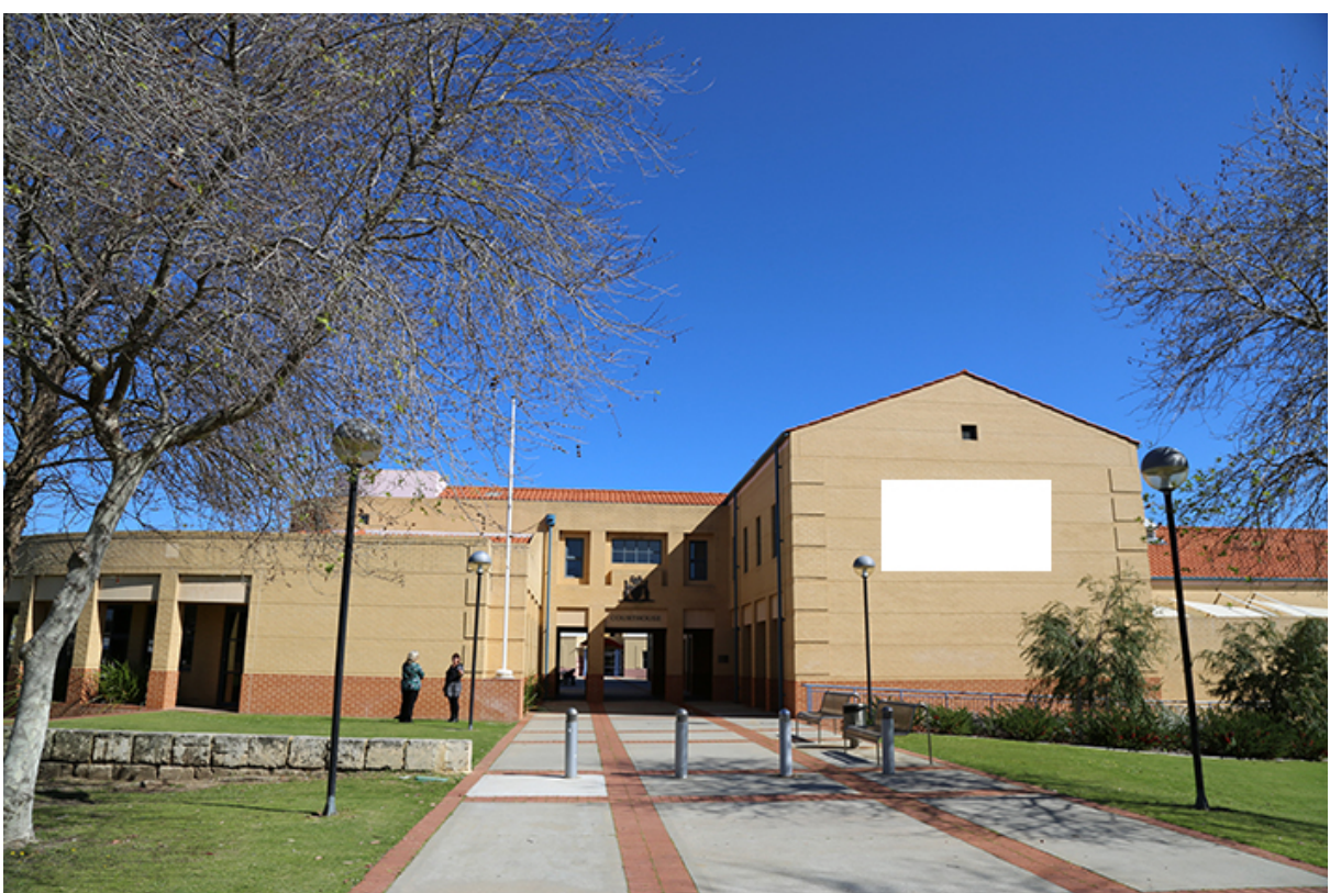
A wall based custom billboard could be installed on the Courthouse East facing wall however a window would need to be permanently blocked off.