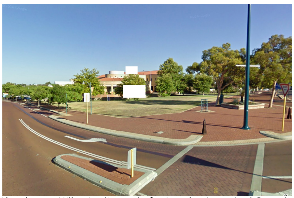
View of proposed billboard positions on the Courthouse front lawn and roof. Due to the nature of the building, a rooftop billboard would need to be custom built.