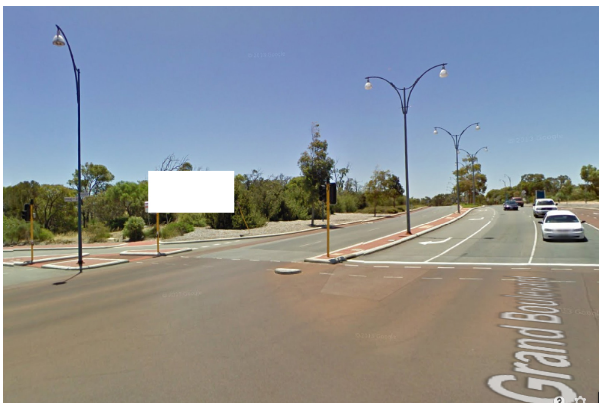
View of proposed billboard situated on the North West corner, facing South East across from the main entrance to ECU.