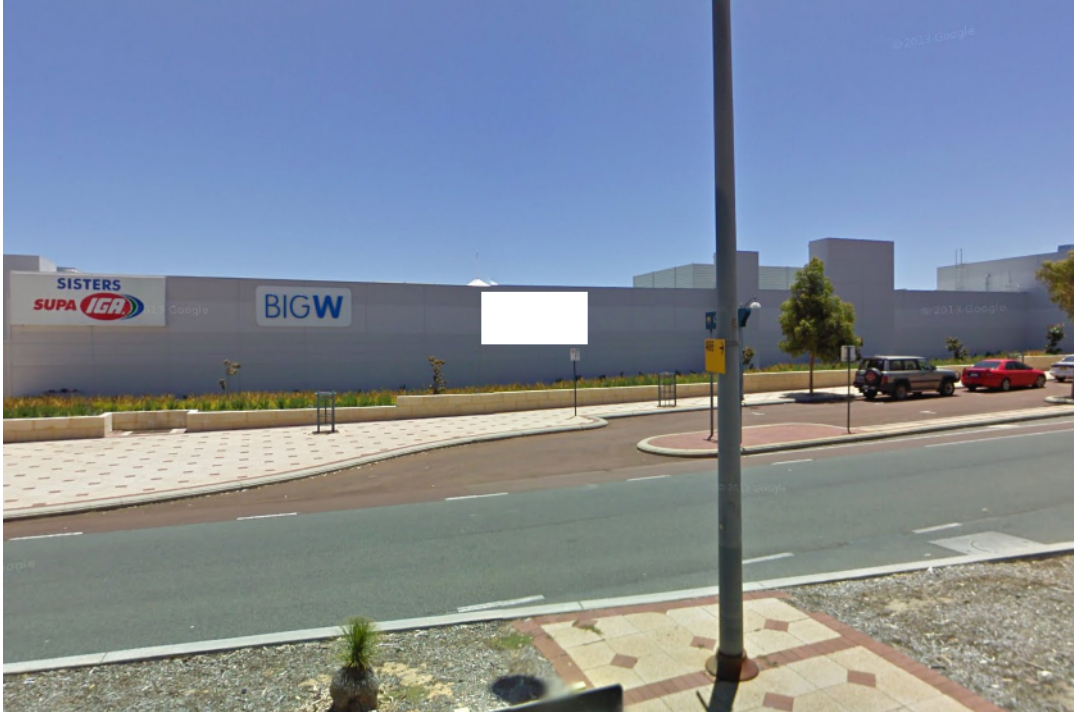
Proposed view of a wall mounted billboard on Lakeside Joondalup Shopping City building, facing East on Grand Boulevard.