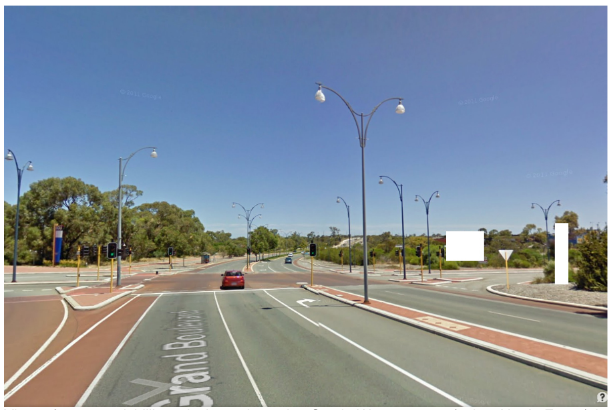
View of proposed billboard situated on the South West corner, facing North East (also showing a side view of the billboard on the North West Corner facing South East).