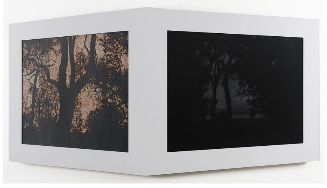
Tony Windberg Meeting Points, 2013 2m x 1m per panel Commissioned and purchased for $15,000 in 2013 Currently valued as part of the City of Joondalup Collection at $17,000

Windberg uses separate panels, alternate approaches and multiple materials, both organic and synthetic, to depict iconic landmarks within the City of Joondalup. The organic is represented on the left hand side panels using engraved images through layers of bound ash, charcoal and resins on canvas. This contrasts with the synthetic materials on the right, digital prints under layers of mesh.