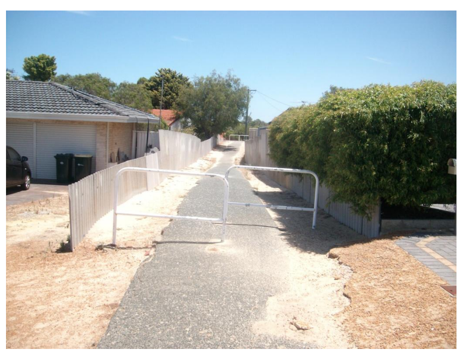
Approach to the PAW off Carnegie Way.