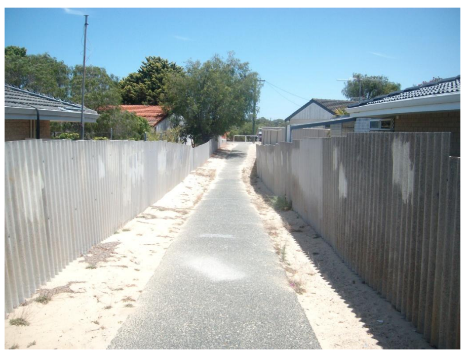
View along the PAW in a northerly direction towards Rowlands Court. Evidence of graffiti removal can be seen on the fencing.