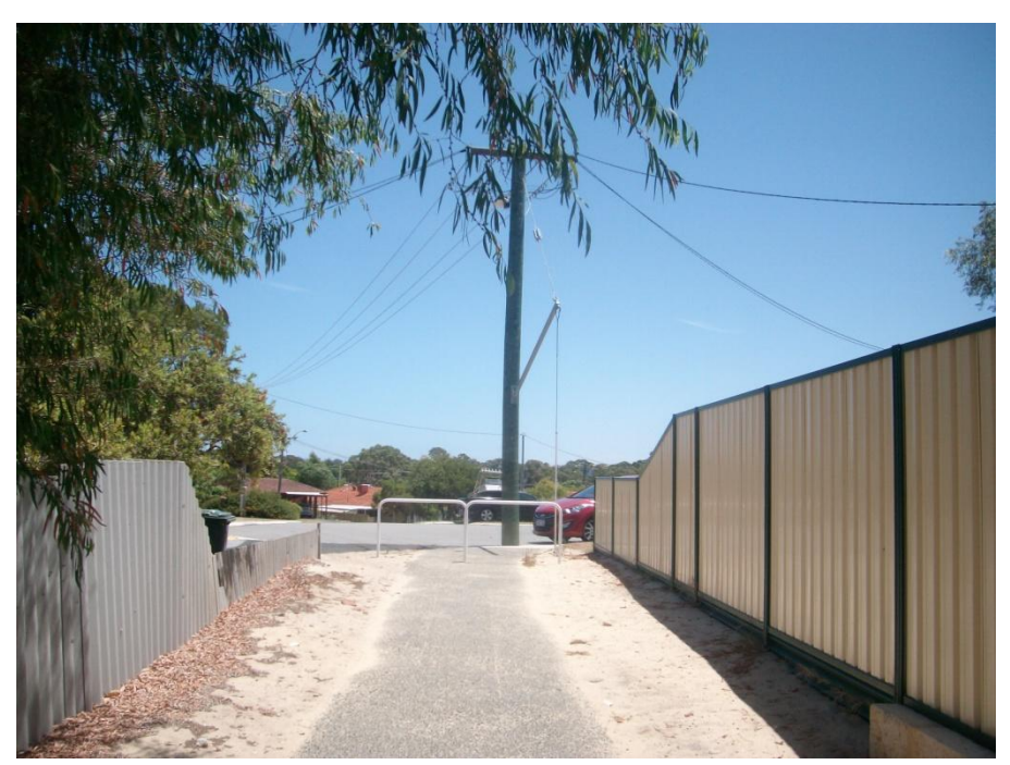
Approaching Rowland Court PAW interface.