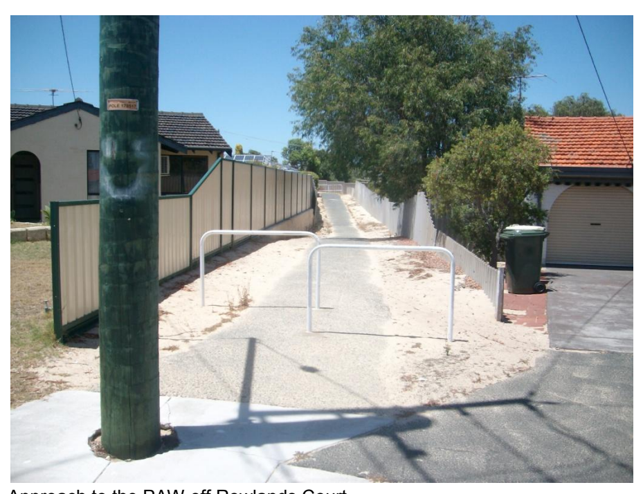
Approach to the PAW off Rowlands Court.