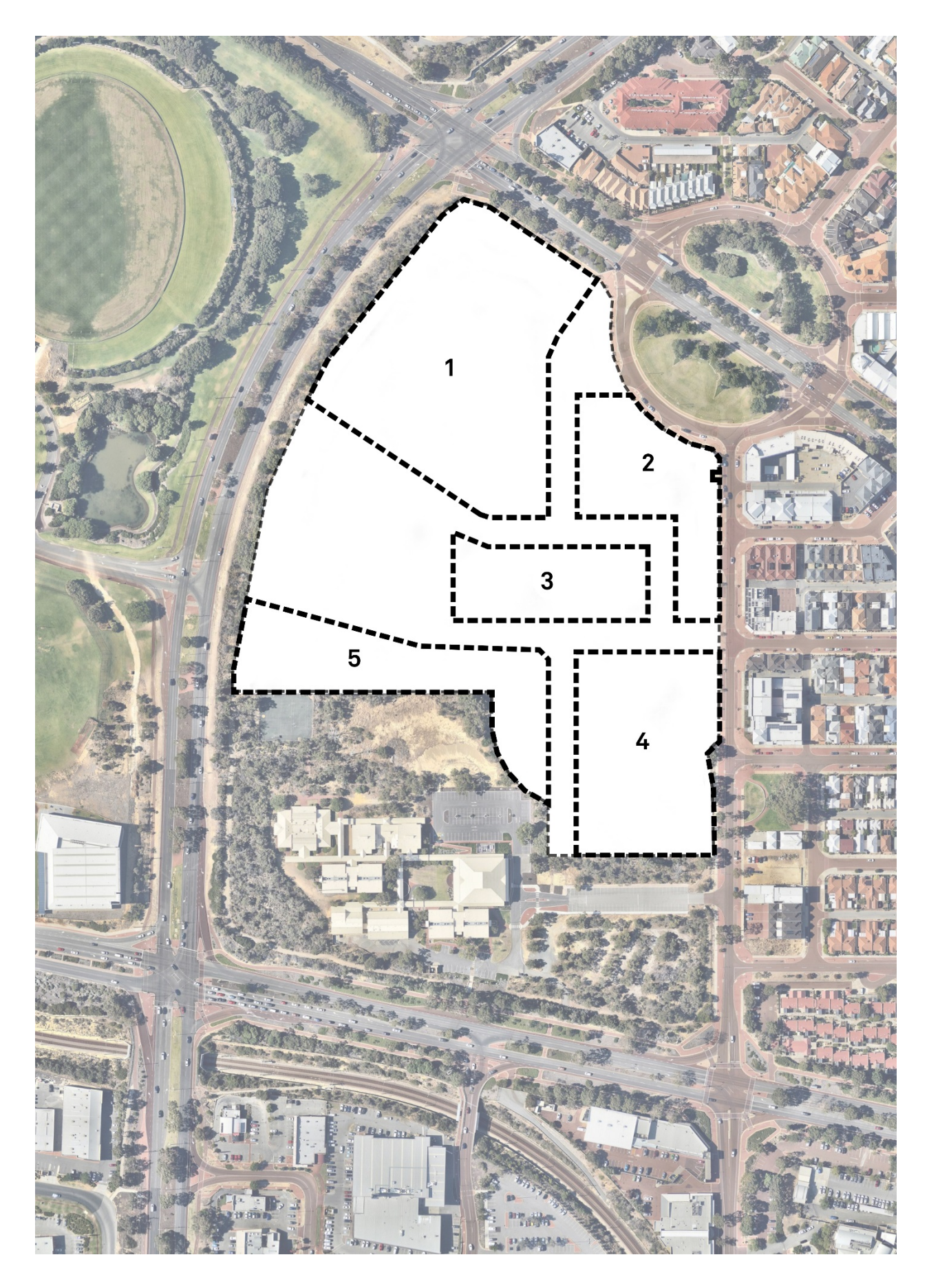
Figure 3. Precinct Areas