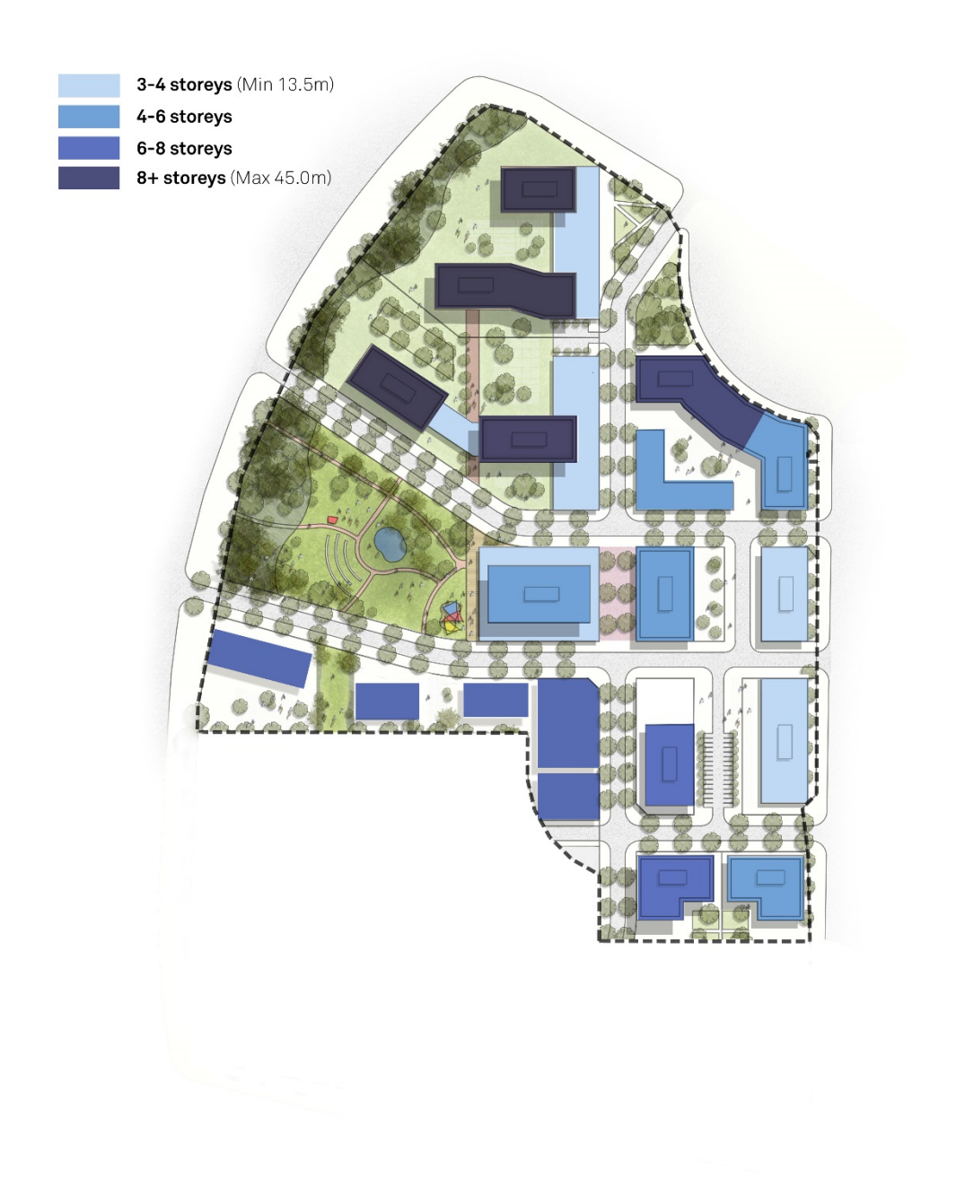
Figure 4. Indicative Building Heights