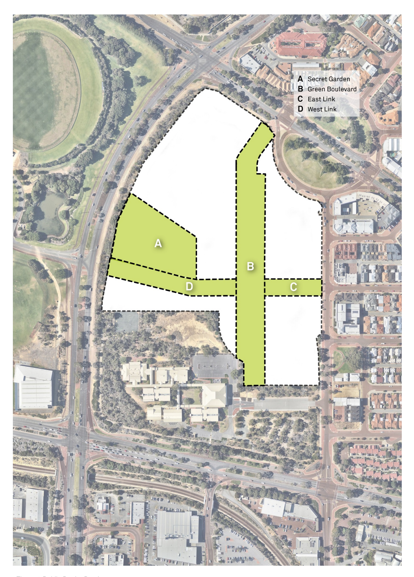
Figure 6 Public Realm Precincts