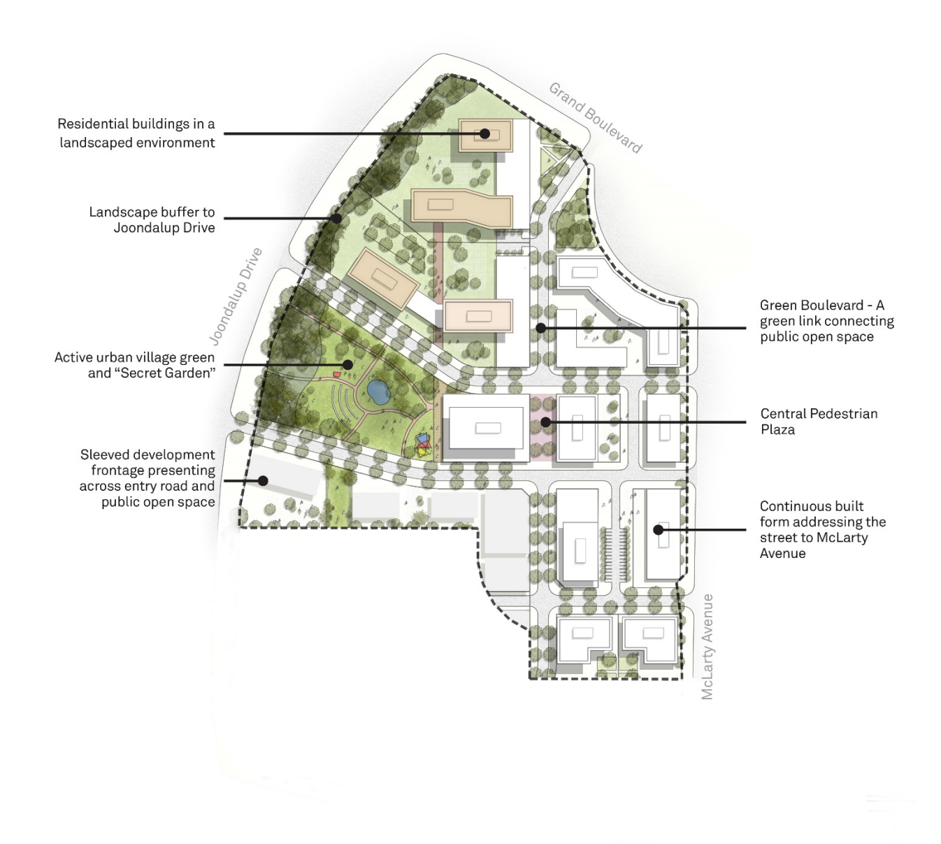
Figure 2 Indicative Development Plan