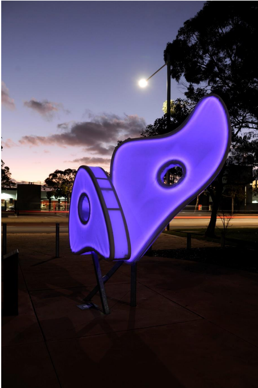
Artist: Brandon Ballengée Title: Emperor Gum Moth Year: 2016 Medium: Aluminium frame, canvas, LED lights