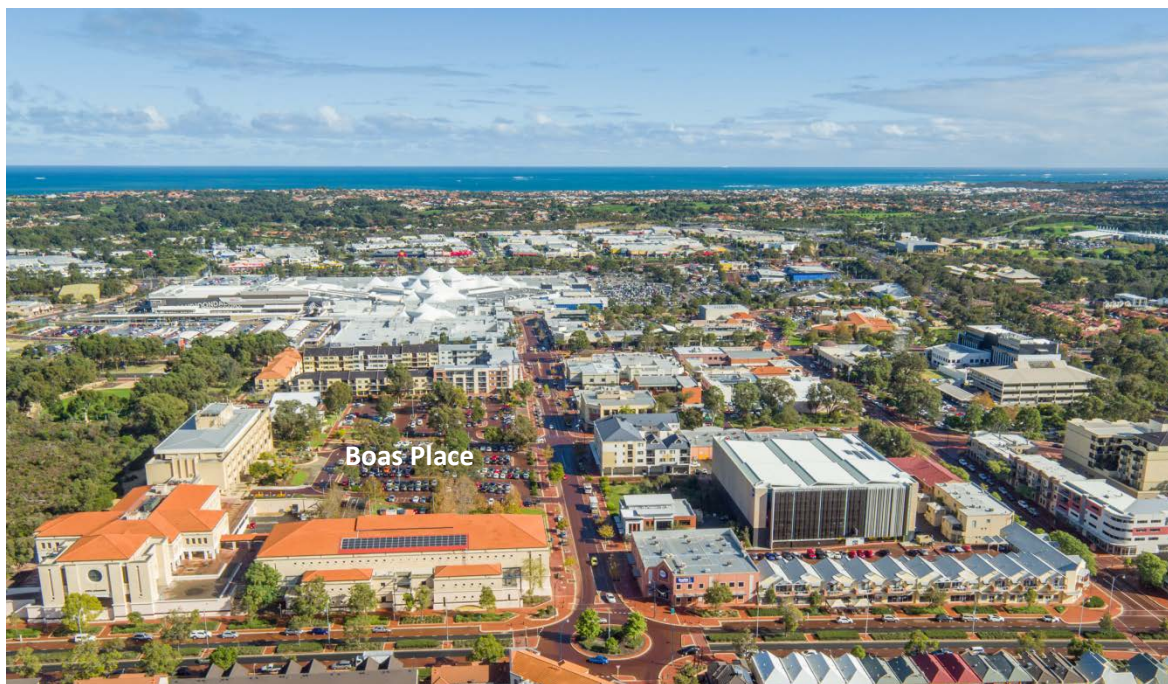
Site Plan: Joondalup City Centre Development – Boas Place