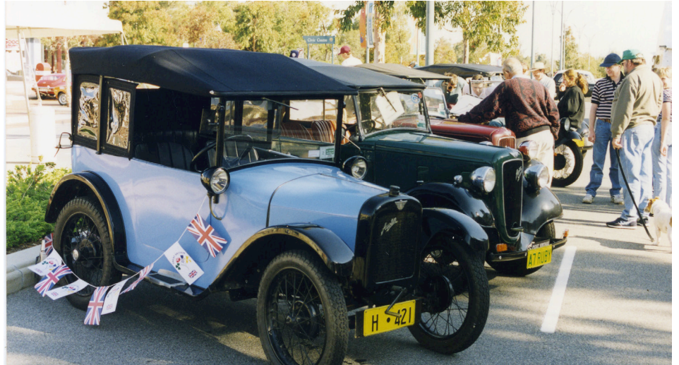
P00494.02 Car enthusiasts inspect the vintage and classic cars on display in Grand Boulevard near the corner of Boas Avenue at the inaugural Joondalup City Speed Classic on 25 October 1998.