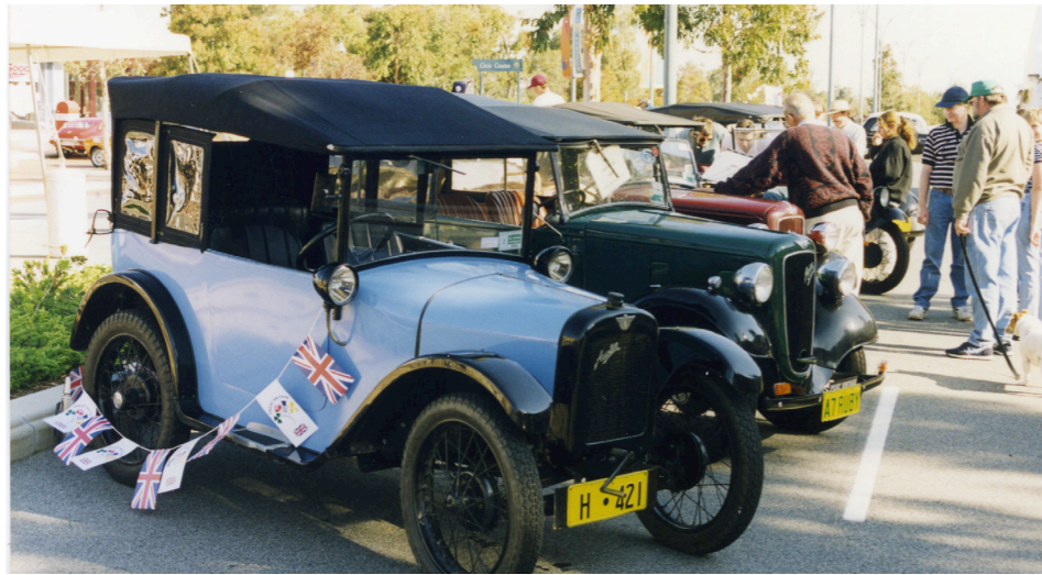
P00494.02 Car enthusiasts inspect the vintage and classic cars on display in Grand Boulevard near the corner of Boas Avenue at the inaugural Joondalup City Speed Classic on 25 October 1998.