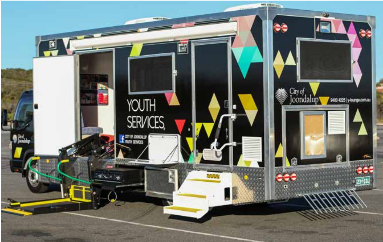
The City's Youth Services team launched its Youth Truck, which is a purpose built mobile youth centre that includes a wheelchair hoist and is fully accessible.