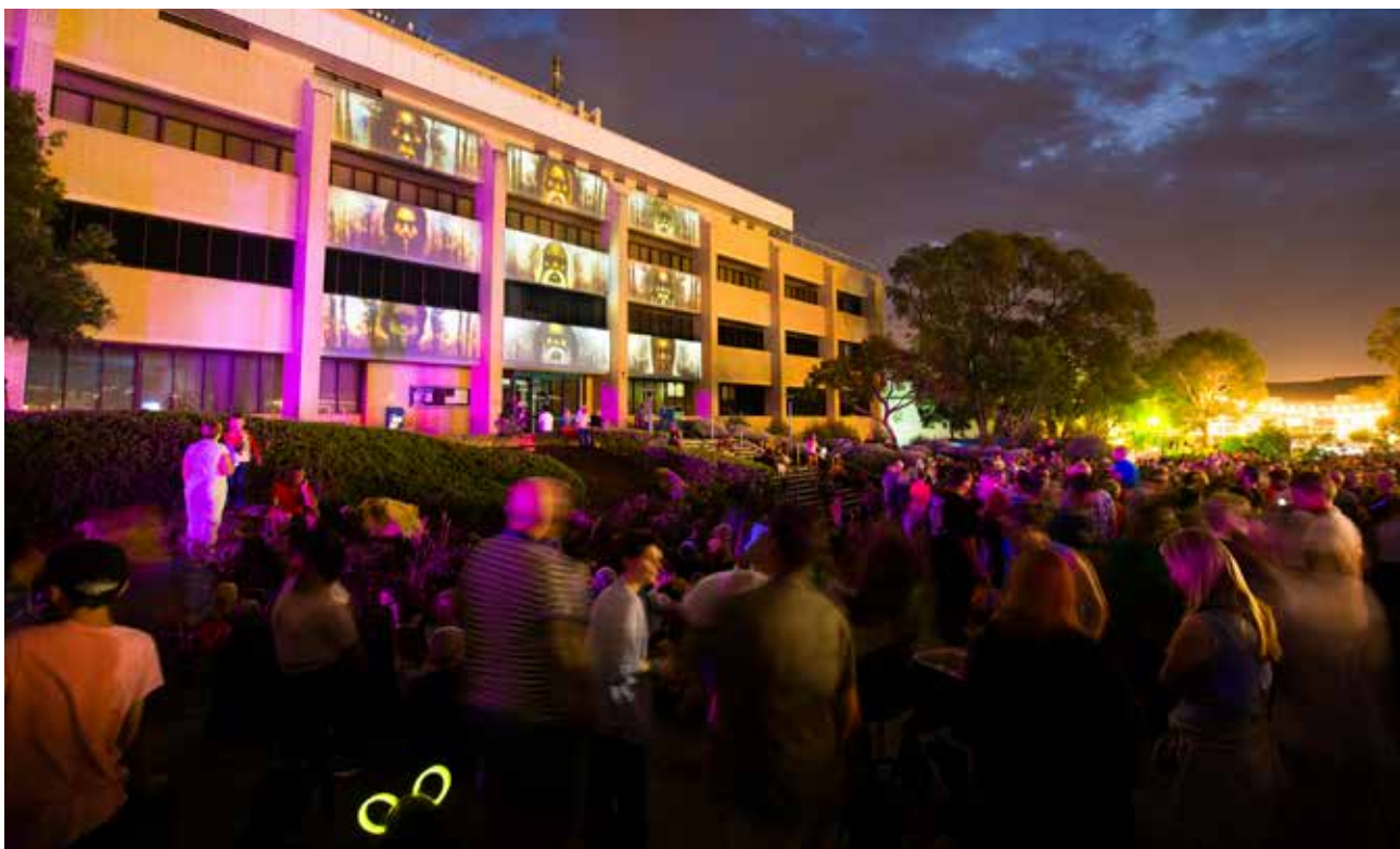
Dadaa Arts was engaged for the Kaleidoscope Festival to provide audio interpreted tours of the festival to people who are blind or have low vision; 30 people participated in the audio tours of the Kaleidoscope Festival.