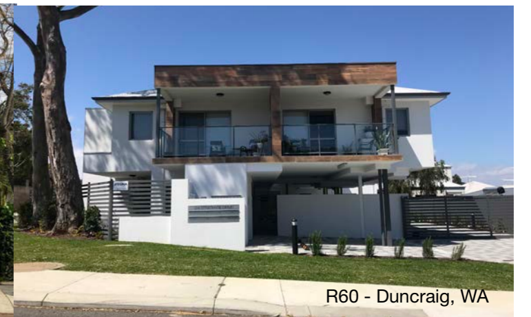
R60 - Duncraig, WA