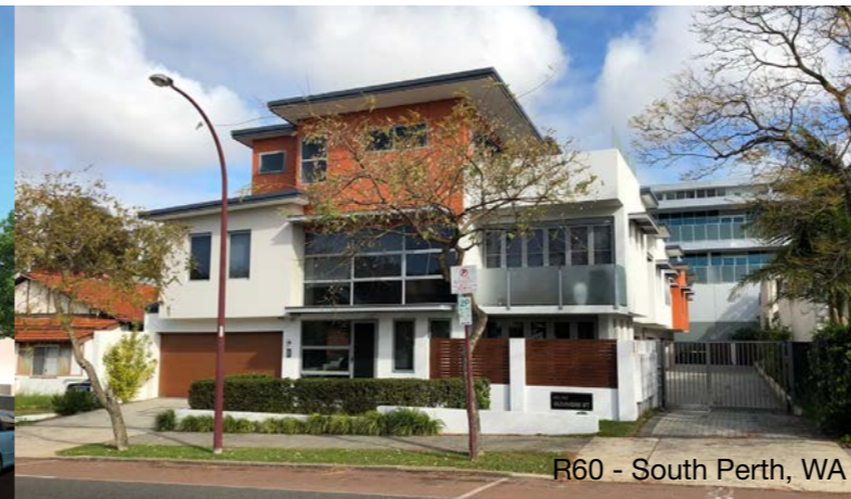
R60 - South Perth, WA