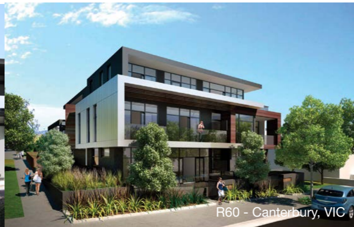
R60 - Canterbury, VIC