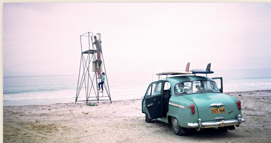
Dennis family at Mullaloo Beach, 1965

Available from City of Joondalup Libraries and customer service centres. At $42.00 it's an ideal Christmas gift.