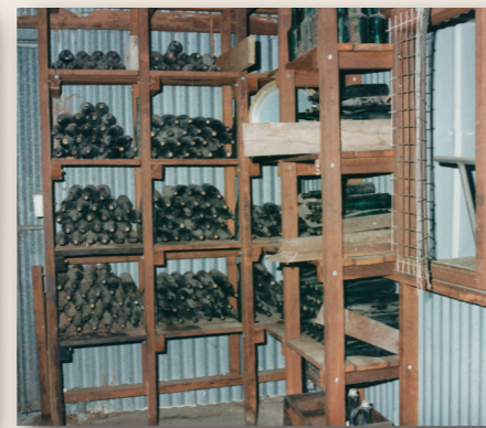
Exterior front view of Luisini, 1986