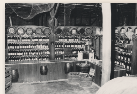
Luisini Wine tasting cellar, 1986

Using Grenache and Muscat grapes they specialised in red wine which they delivered in flagons from their truck.