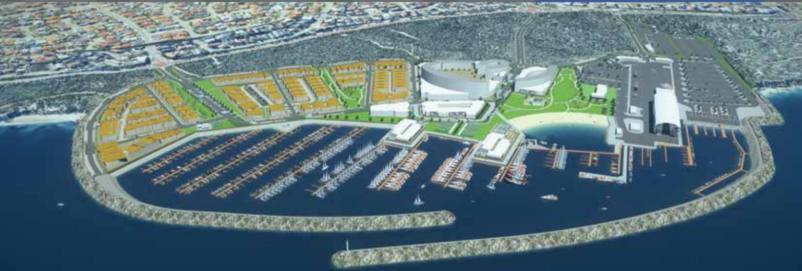
Indicative artwork of how the marina could look.