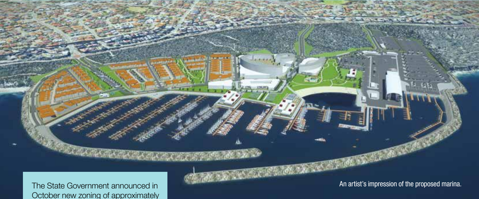
An artist's impression of the proposed marina.

The State Government announced in October new zoning of approximately 65ha for a waterfront precinct at Ocean Reef, which will enable works to commence on the long awaited marina redevelopment.