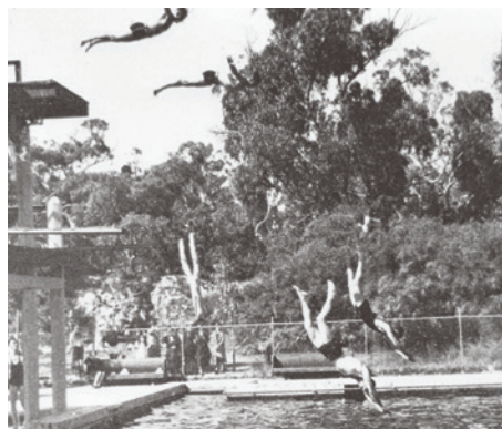
Olympic swimmers and divers at Gloucester Lodge swimming pool, Yanchep, in 1936, training for the Berlin Olympic Games.

In 1931 construction began in the park on the Crystal Pool and Guest House to provide affordable accommodation for holiday makers from Perth.