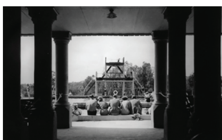
A view of Gloucester Lodge pool showing the diving tower ca. 1935.

The guest house was named Yanchep Lodge but in 1939 it was renamed Gloucester Lodge in honour of Henry, Duke of Gloucester who stayed there on 5 October 1934. The Gloucester Lodge Swimming Pool was considered one of the best pools in Australia at the time but was decommissioned in the early 2000s when it was found to be too costly to repair.