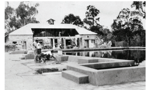
The Crystal Pool and Guest House (later Gloucester Lodge) under construction.

'I remember we dropped in lots of large rocks, but they would disappear after a short while. Eventually palm leaves were laid and teams of men mixed concrete, putting it on to the leaves. That's how the pool's floor was made.'