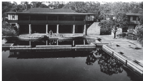
Rear view of Crystal Pool Guesthouse 1934.

Two Western Australian competitors, Evelyn de Lacy and Pervical (Percy) Oliver were selected for the Olympic team and travelled to Berlin by ship along with a live kangaroo mascot named 'Aussie.'