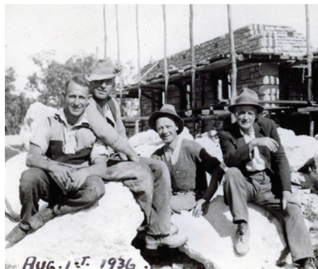
A group of Yanchep sustenance workers at the Yanchep Inn construction site ca. 1936.

Residents may remember the City of Joondalup hosted the Olympic Torch Relay through the northern suburbs on its worldwide route to the 2000 Sydney Olympics. What is not widely known is Yanchep's connection to the 1936 Berlin Olympics.