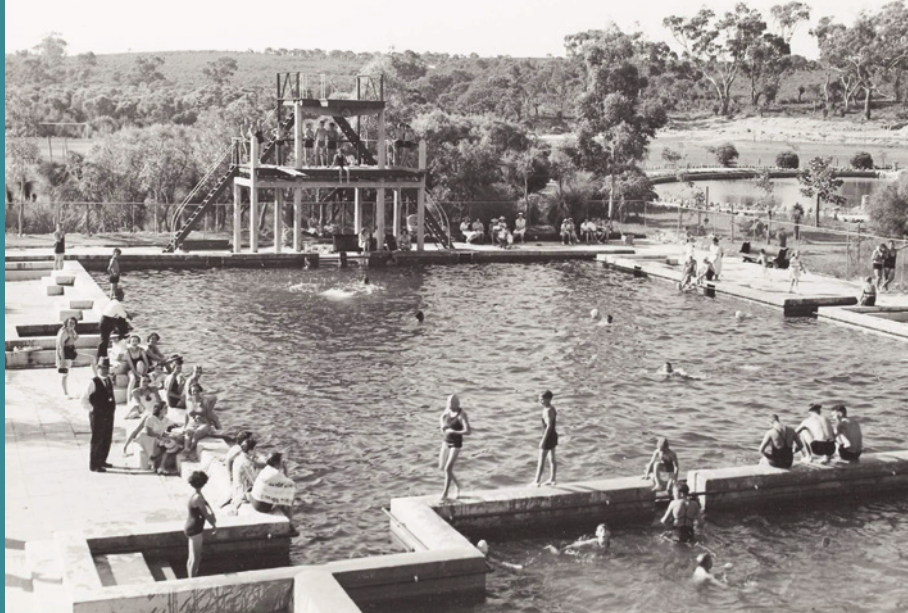
Crystal Pool Bathing Pavilion ca. 1938.

The 32nd Games of the Olympiad, Summer Olympics were due to be held from 24 July - 9 August, 2020 in Tokyo, Japan. Due to the COVID-19 pandemic the Games have been postponed until 23 July 2021.