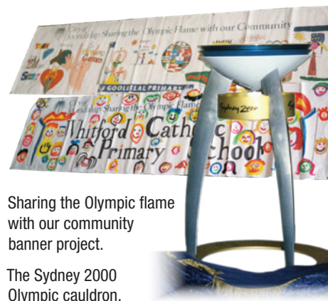
Sharing the Olympic flame with our community banner project.

If you have any photographs of the torch relay passing through Joondalup that you would like to send, please email local.history@joondalup.wa.gov.au or phone 9400 4746.