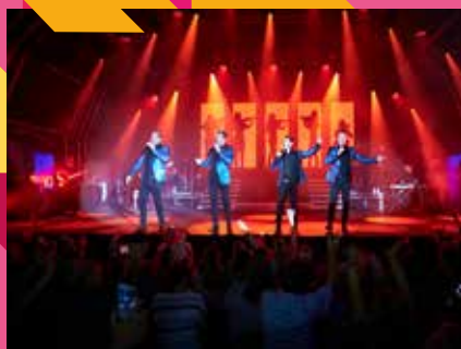
Photo: Human Nature, Valentines Concert 2020