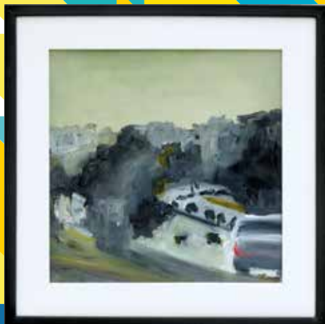
Image: Moving , 2019 by Annette Peterson – 2019 Most Outstanding Artwork Winner

The City celebrates the talents of the visual arts community through this annual exhibition of approximately 150 exhibiting artists. The exhibition features a range of artworks including paintings, sculptures, photographs, works of paper, textiles, and mixed media works. There are various award categories and additional prizes awarded to artists, plus a Popular Choice Award which is voted by the public.