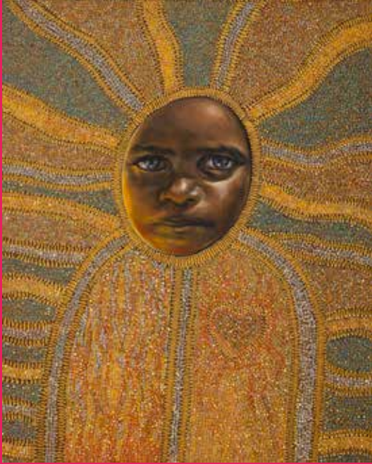
Image: Icon to a Stolen Child, Yalli Birri (Emu Girl) , 2016 by Julie Dowling, mixed media

The City's art collection comprises of over 240 artworks. With a primary focus on the work of Western Australian contemporary artists, the collection also represents artists connected with, and themes relevant to, the City of Joondalup.