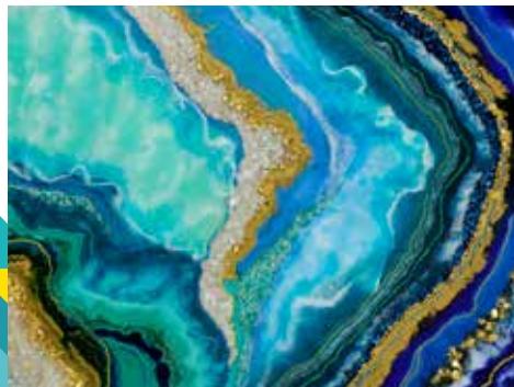
Image: Aquamarine , 2019 by Sharyn Jackson – 2019 Popular Choice Winner