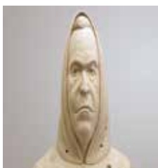
Image: Mute Figure #10 (detail), 2019 by Paul Kaptein – 2019 Overall Winner

Invitation Art Prize is an annual exhibition held in Westfield Whitford City Shopping Centre during October. This exhibition showcases the works of up to 30 Western Australian artists and gives the community the opportunity to view contemporary artworks from a range of mediums. The exhibition is accompanied by a series of public programs to improve access and understanding of contemporary visual arts.