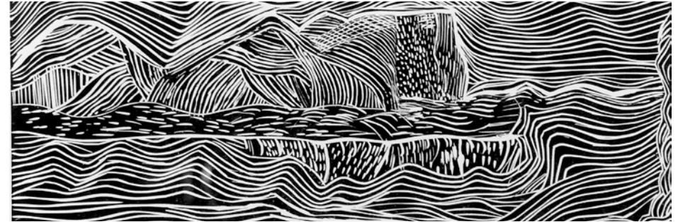
Landscape, 2009, Lino cut on paper, by B (Noongar People). Produced as part of the From the Inside project.

8 – 30 November, visit joondalup.wa.gov.au for opening hours City of Joondalup Libraries – Joondalup, Boas Avenue, Joondalup