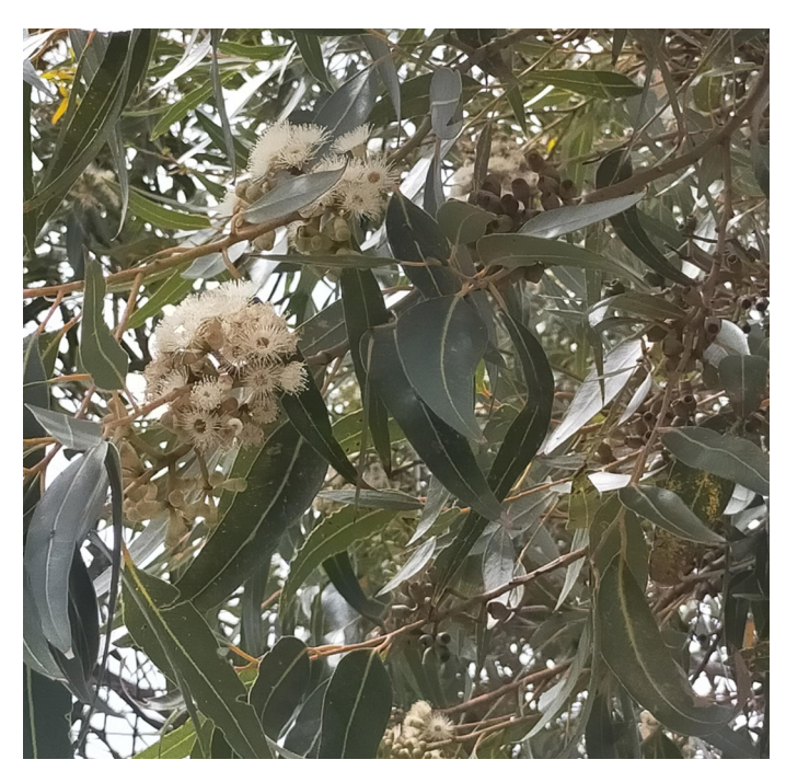
Close-up of Dwarf Sugar Gum flowers

The tree has mottled grey bark and produces clusters of creamy white flowers in late summer.