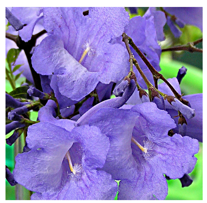
Close-up of Jacaranda flowers

The tree produces an abundance of showy blue to purple, lightly fragrant, trumpet-shaped flowers from late spring through to summer.