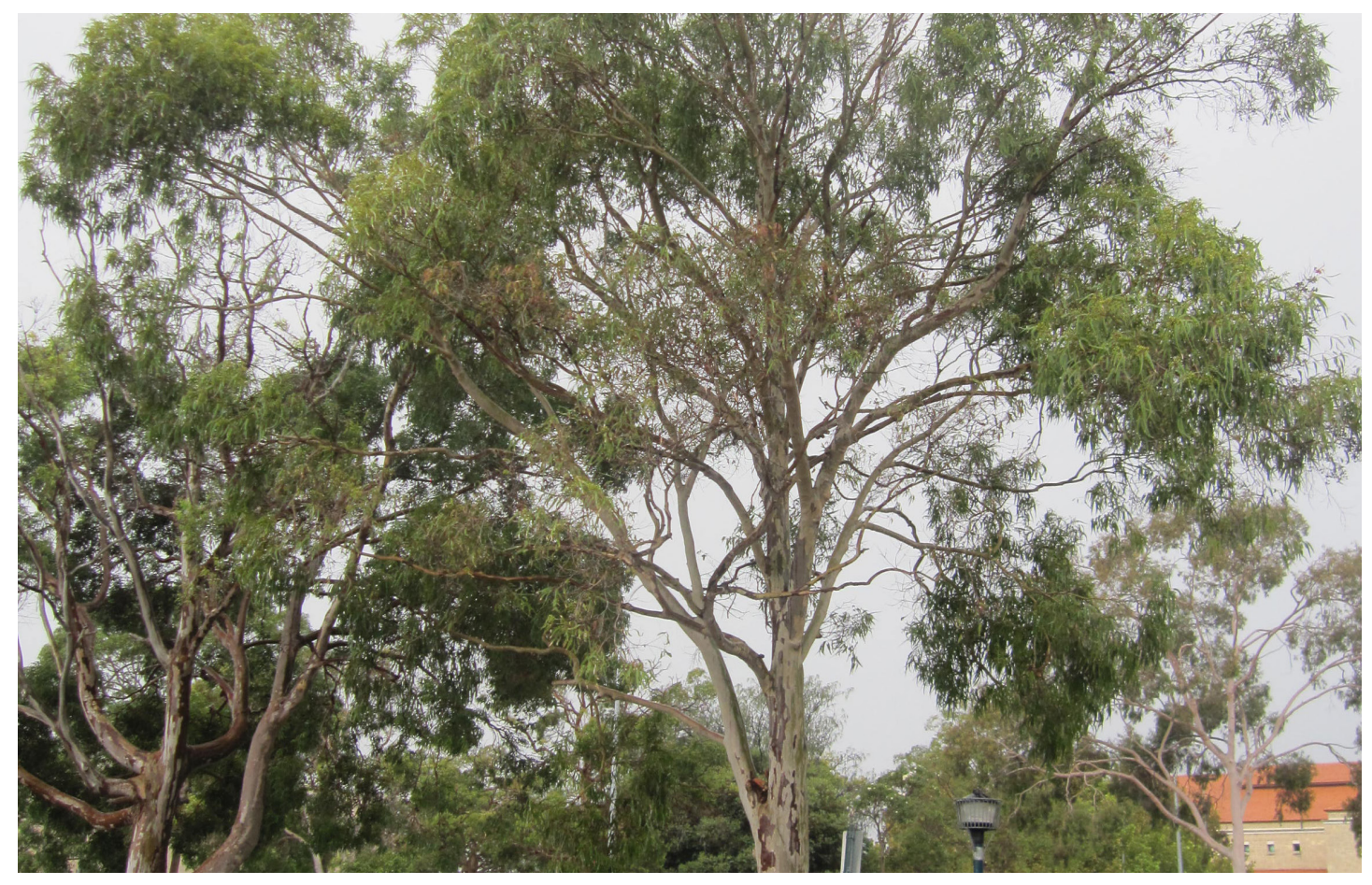
Mature Spotted Gum