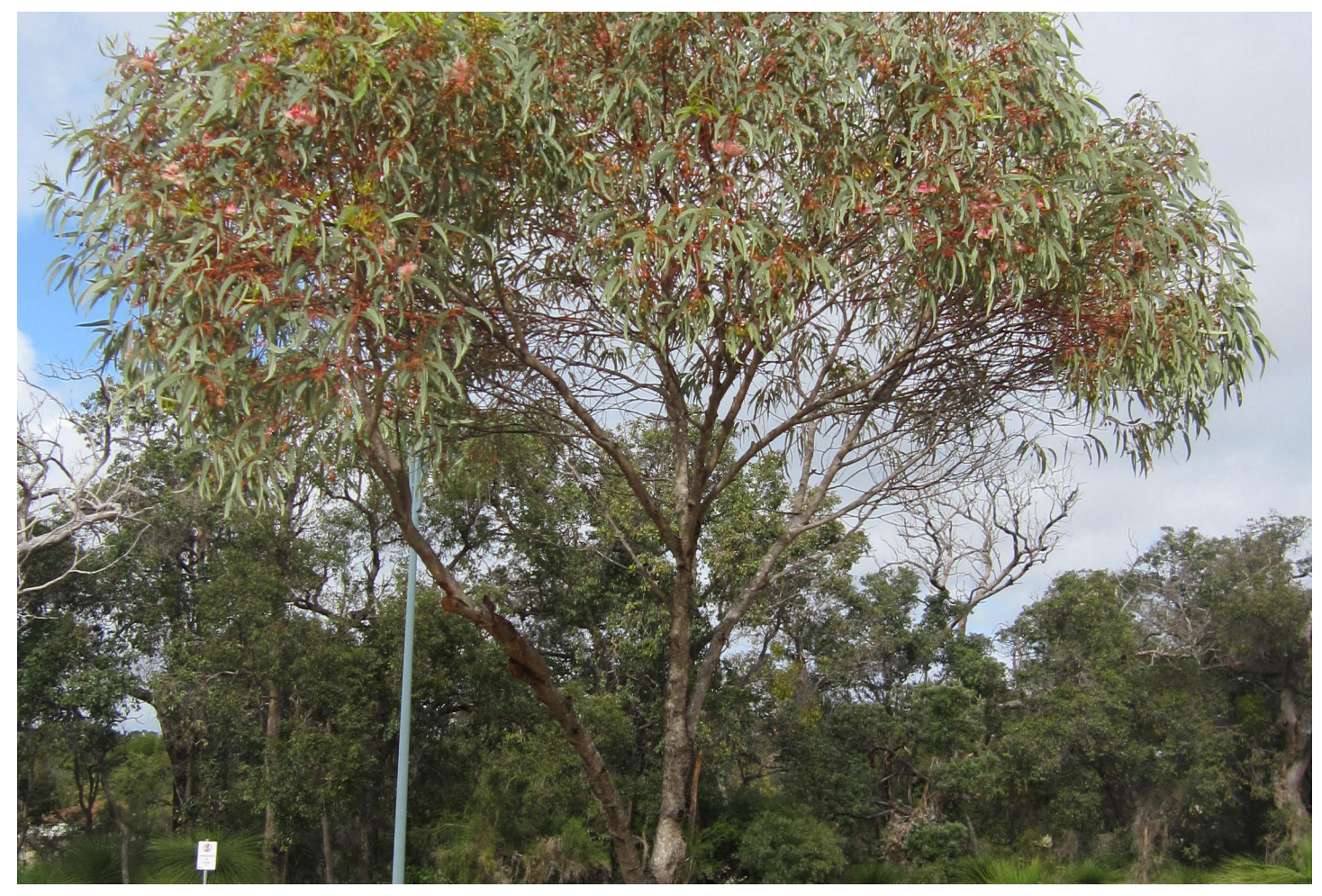
Mature Coral Gum