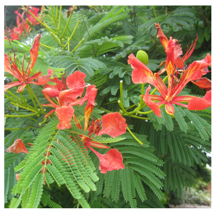
Close-up of Royal Poinciana flowers

The tree has fern-like leaves and produces large, showy, scarlet to red, pea-like flowers in mid-summer.