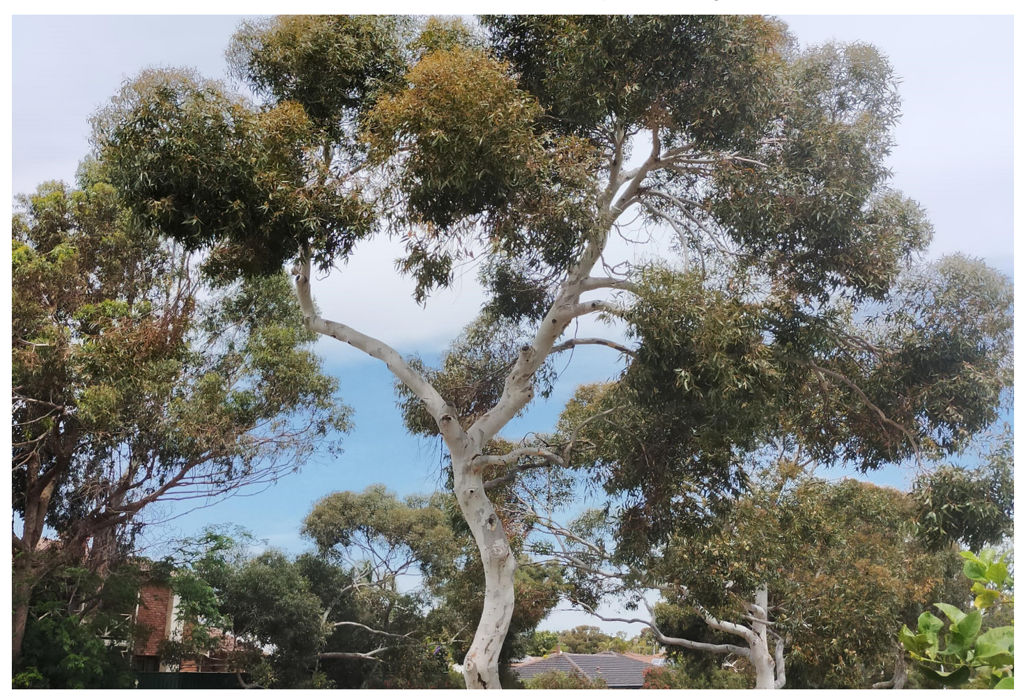
Mature Dwarf Sugar Gum