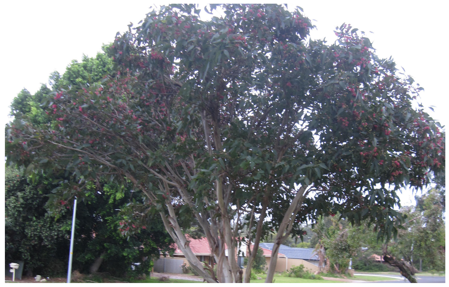
Mature Yellow Gum