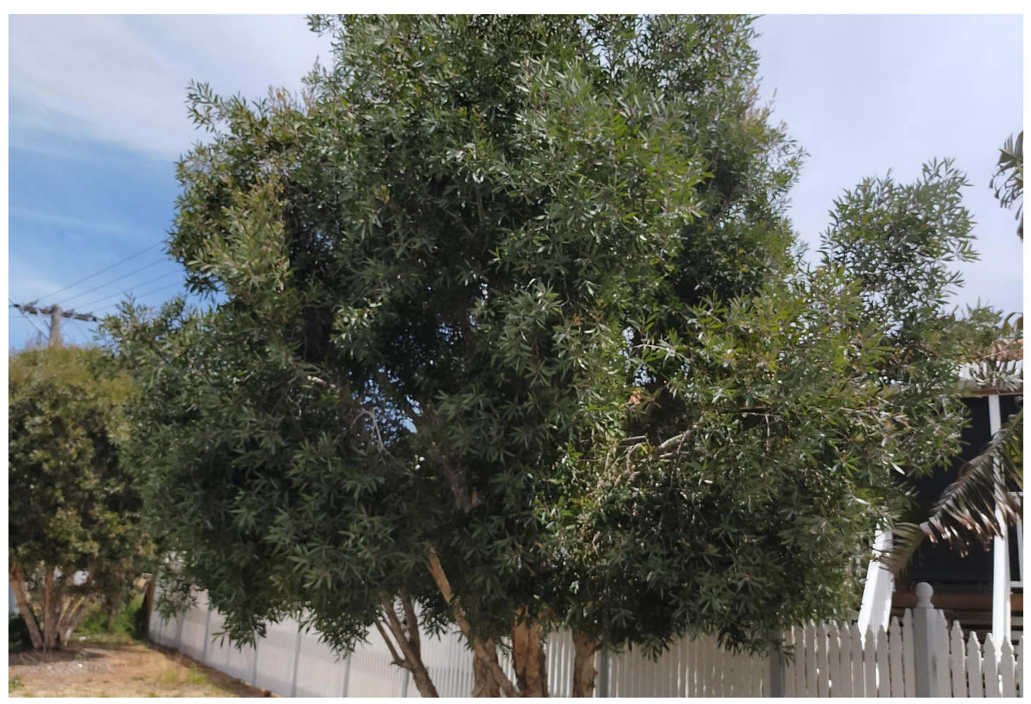
Mature Broad-leaved Paperbark