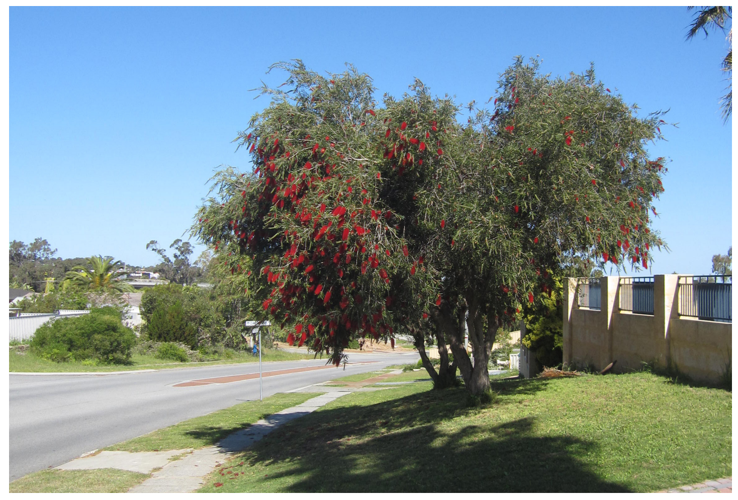
Mature Weeping Bottlebrush