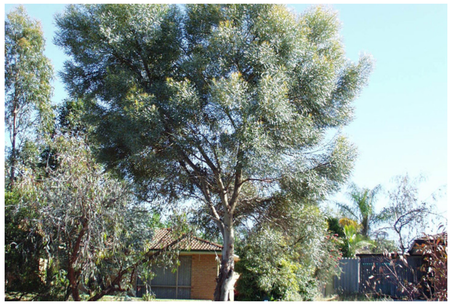
Mature Swamp Mallet