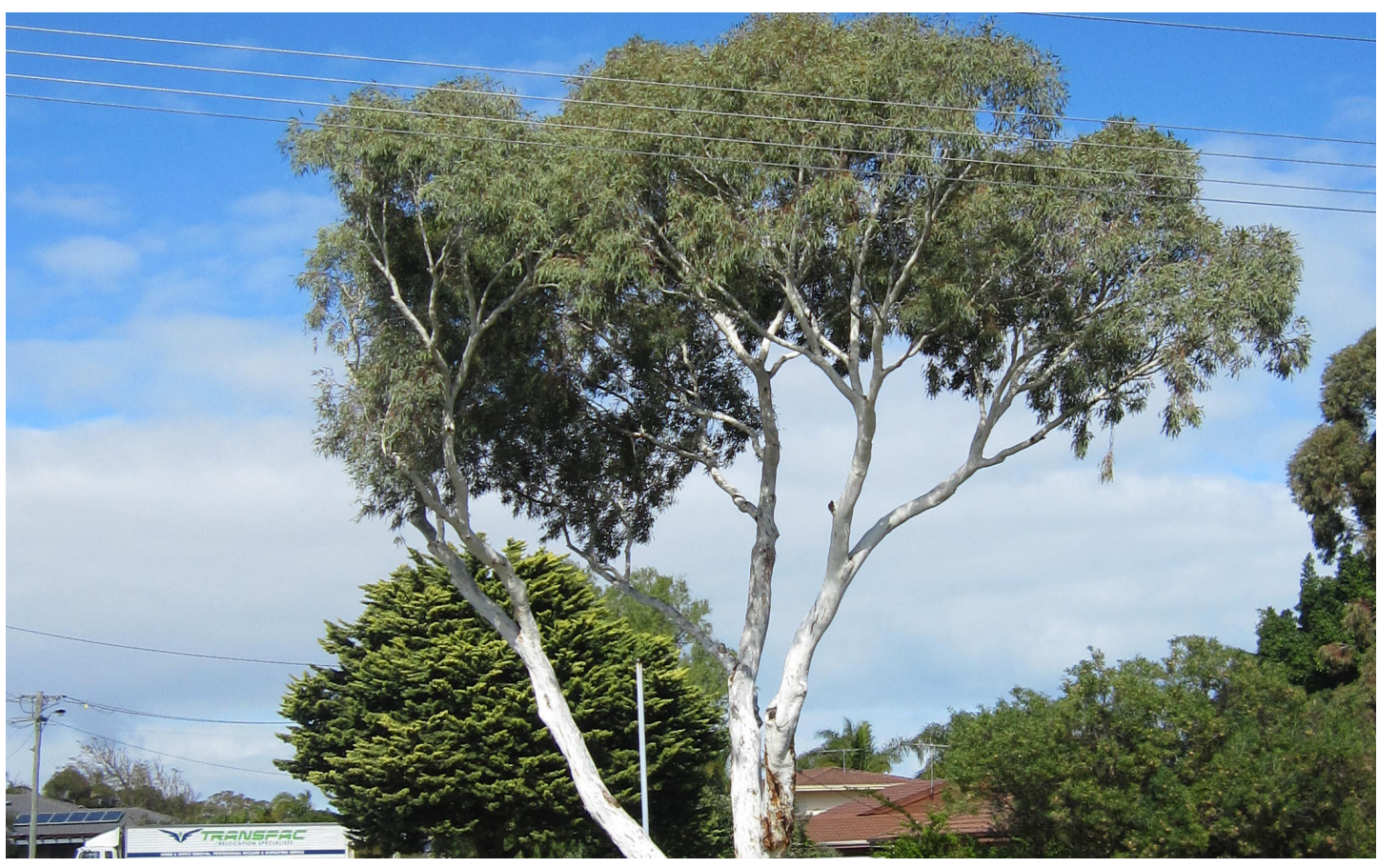
Mature Little Ghost Gum