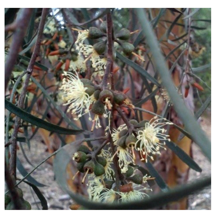
Close-up of Swamp Mallet flower

The tree has satin-like, grey-brown bark and produces cream flowers from winter to summer.