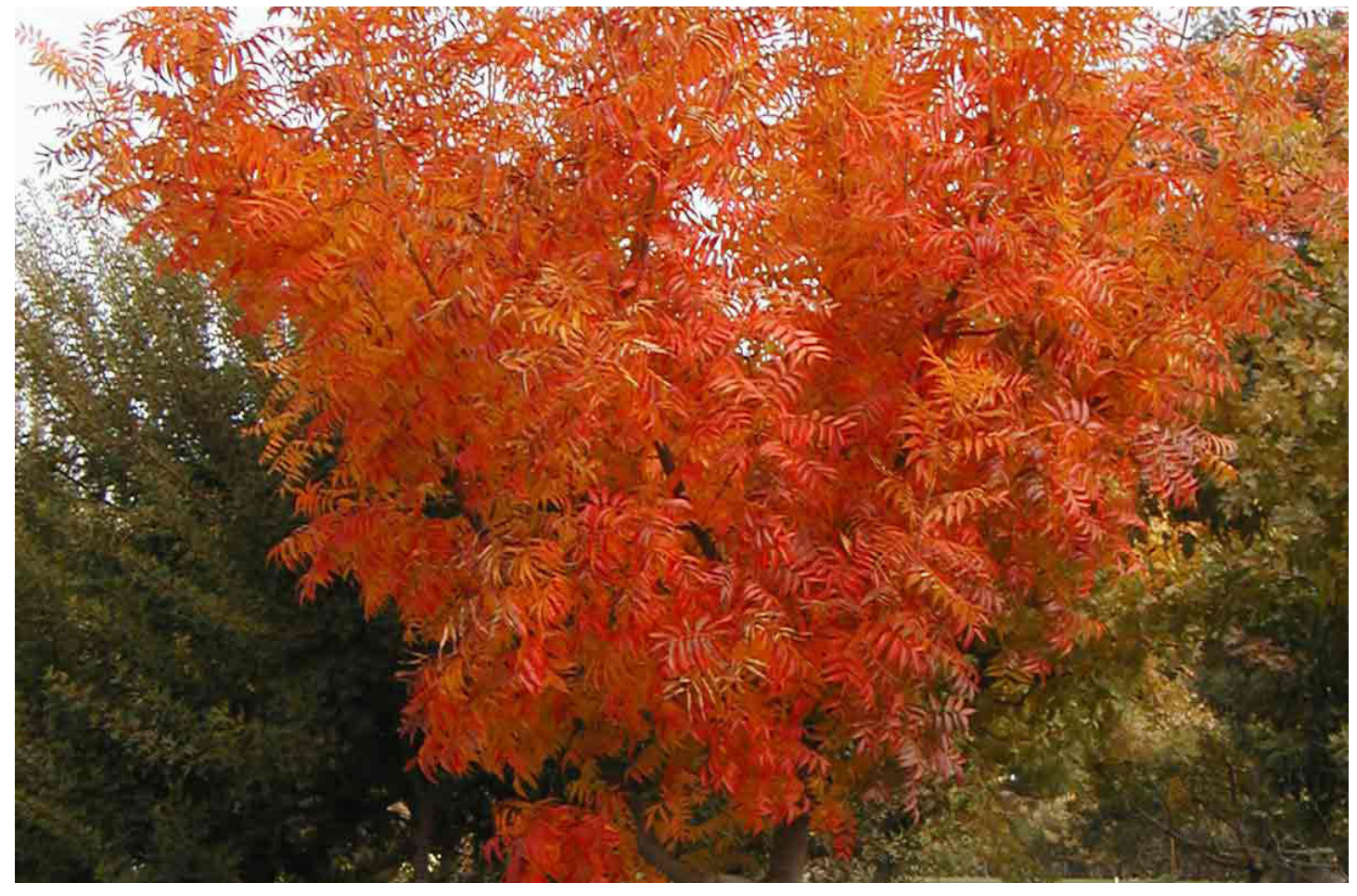
Chinese Pistachio Tree