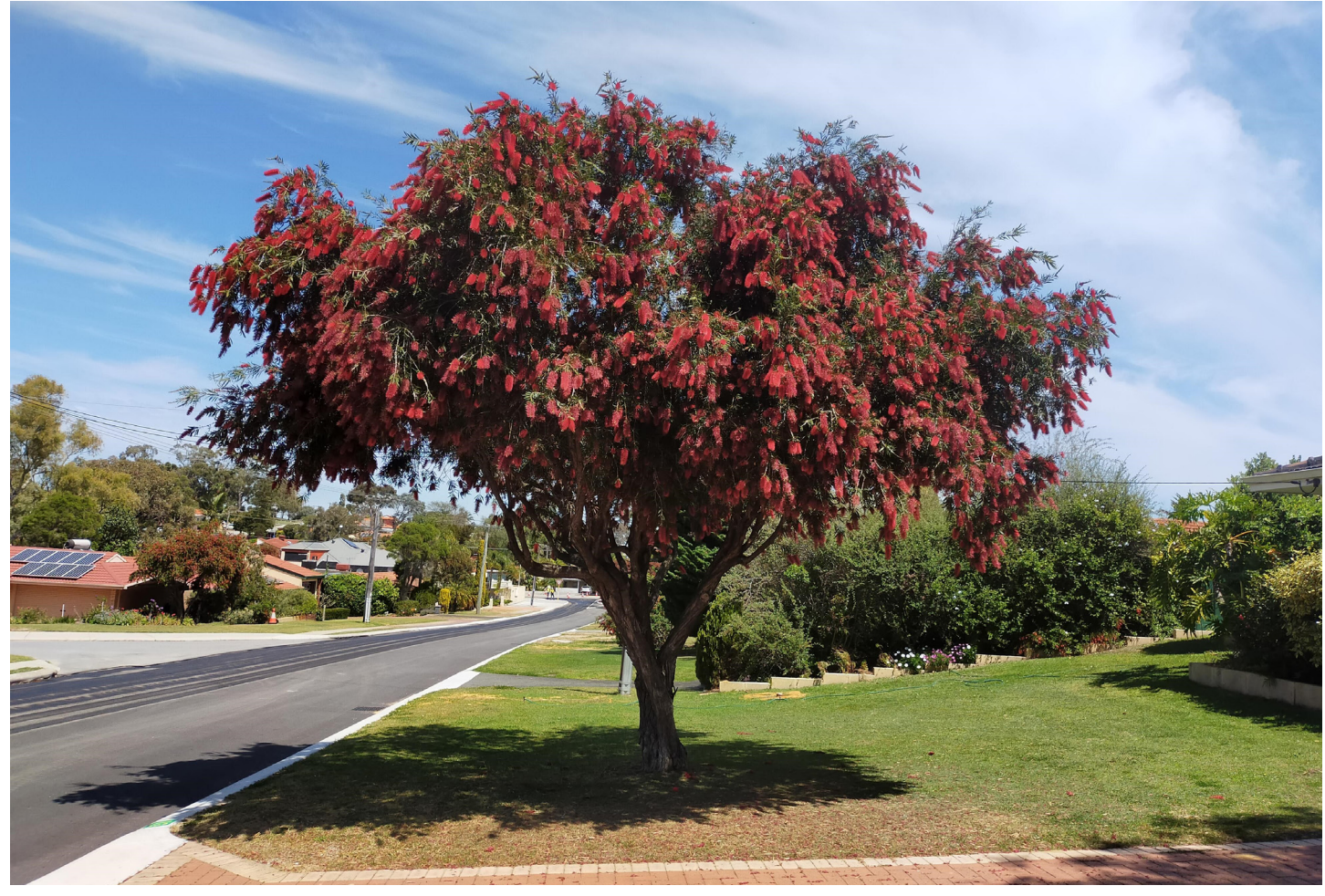
Mature Kings Park Bottlebrush