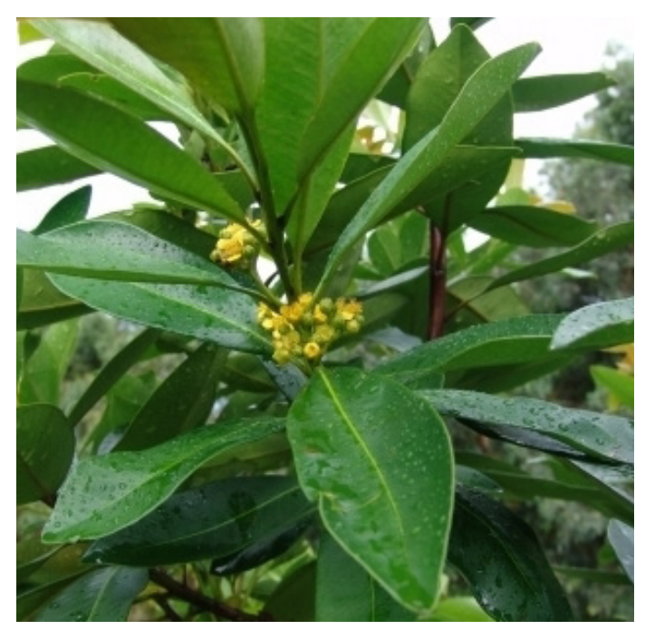
Close-up of Water Gum flowers

The tree has port-coloured bark that peels back to reveal mottled cream patches. It produces short clusters of small, yellow, perfumed flowers in summer which provide a food source for nectar feeding birds and insects.