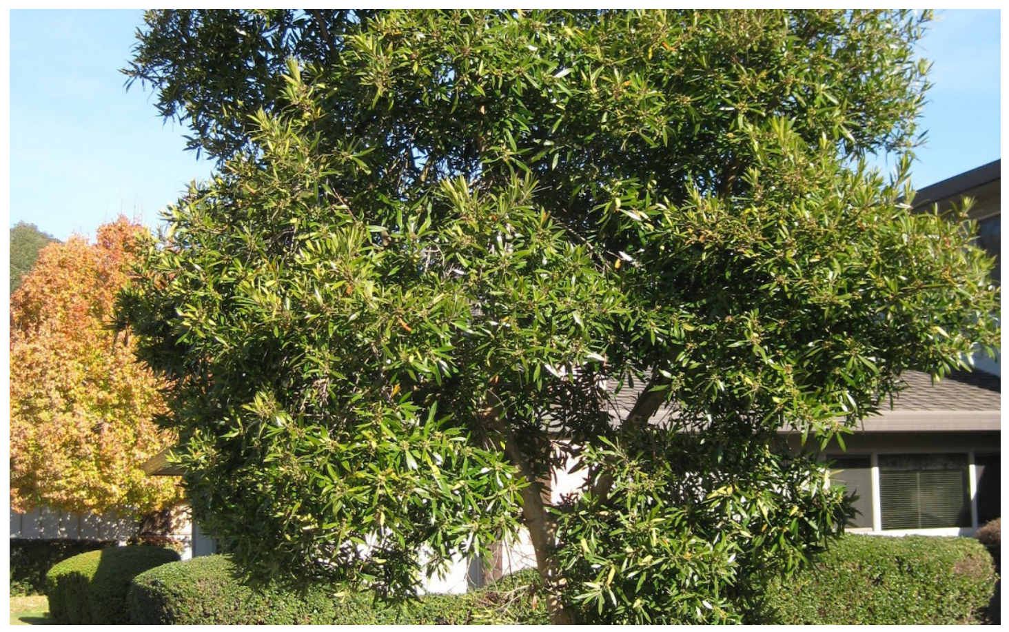
Mature Water Gum