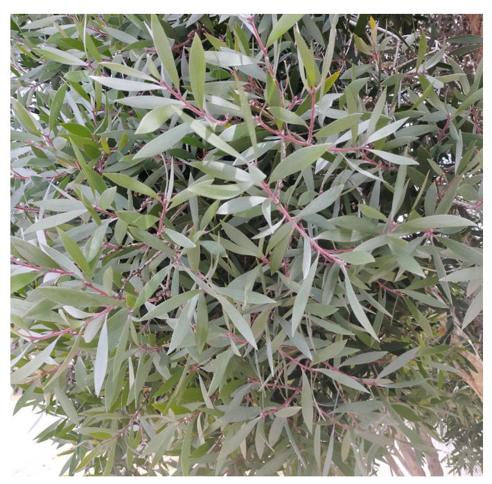
Close-up of Broad-leaved Paperbark bark

The tree has papery, light bark and striking bottlebrush flowers which appear in autumn providing a food source for nectar feeding birds.