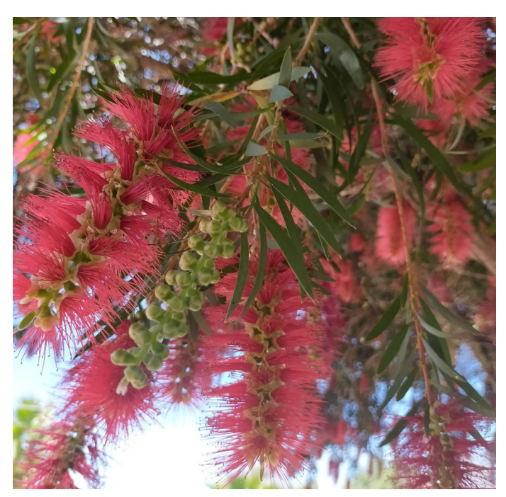
Close-up of Kings Park Bottlebrush flowers

An abundance of brilliant crimson bottle-brush like flowers are produced from spring through autumn. The flowers attract many native and non-native birds.