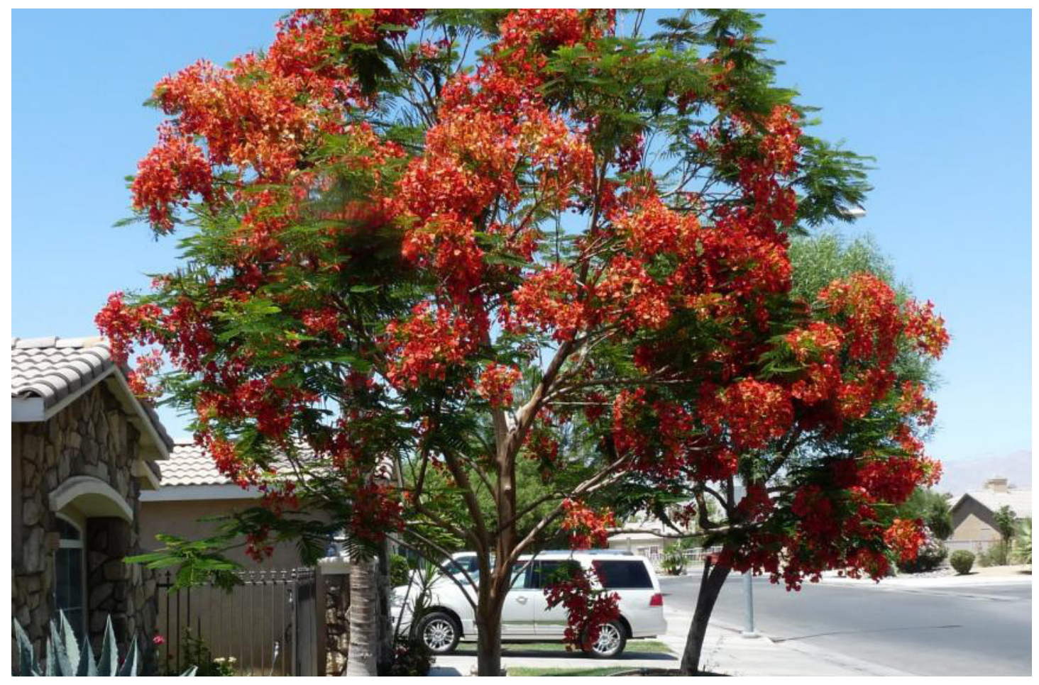
Mature Royal Poinciana