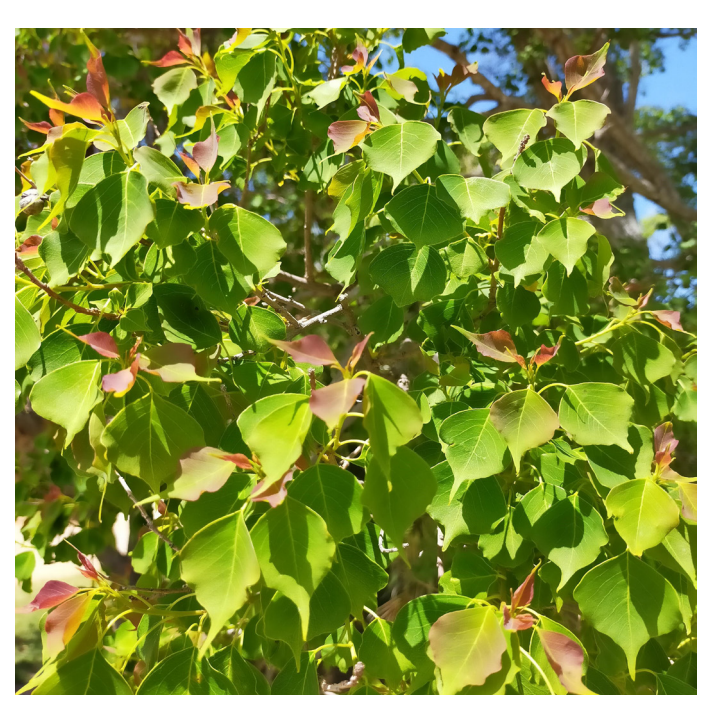
Close-up of Chinese Tallow foliage

Flowers are inconspicuous; however, the autumn leaves create a beautiful colour display.