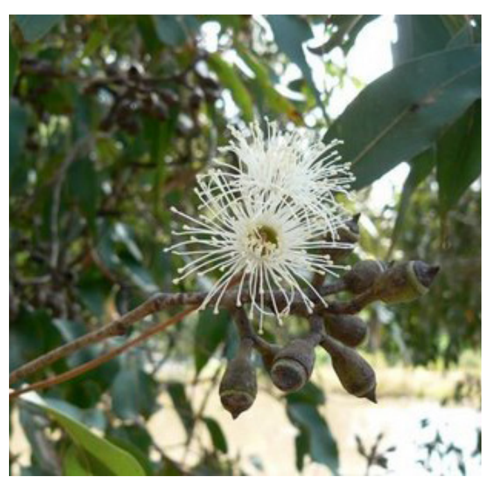
Close-up of Spotted Gum flowers

From winter to spring small, white flowers are produced followed by urn shaped nuts. The flowers have a slight honey fragrance that attracts birds and insects.