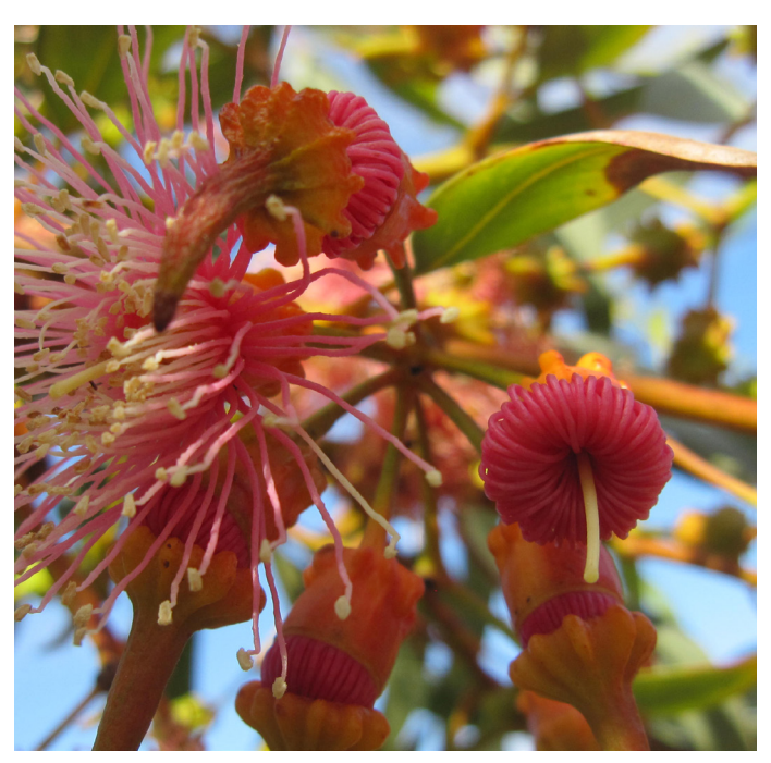
Close-up of Coral Gum flowers

The tree has rough flaky grey-black bark and grey-green leaves. The developing flowers are covered by decorative horned red caps. A prolific display of coral red to pink flowers are produced through spring and summer.