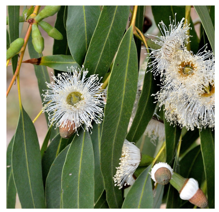
Close-up of Tuart flowers

The tree has rough, greyish, box–like bark that extends the length of the trunk to small twigs. Showy white feather-like flowers appear in mid-summer to mid autumn. Mature trees provide habitats for many native fauna.