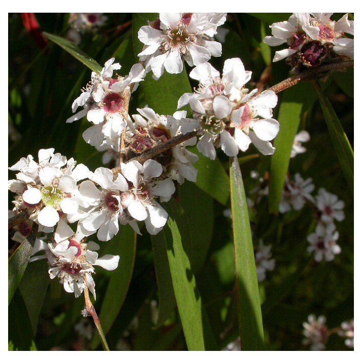
Close-up of Peppermint Tree flowers

It has fibrous brown bark with long narrow dull-green leaves. Clusters of small, white, five petalled flowers are produced from spring to summer.