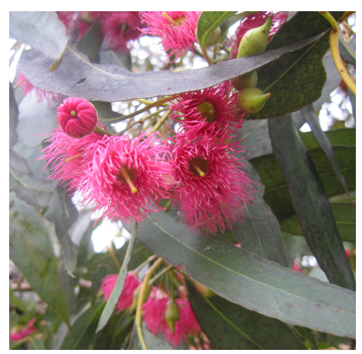
Close-up of Yellow Gum flowers

Showy red to pink flowers are produced in autumn through winter, which attracts birds and insects. After flowering bell shaped seed capsule are formed.