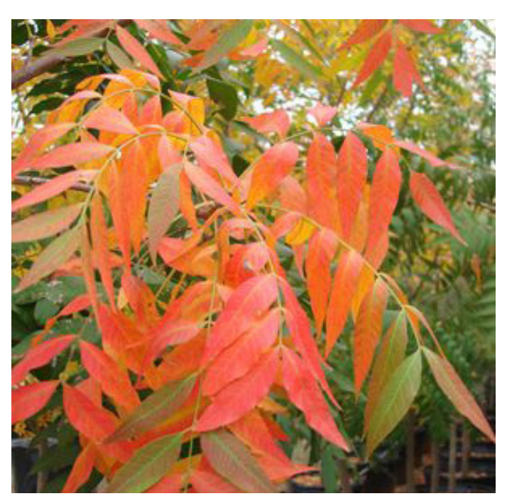
Close-up of Chinese Pistachio autumn foliage

The tree has dark green pinnate leaves in summer. In autumn the leaves turns a variety of bright yellow, orange and scarlet colours, with the colour lasting quite late into winter. This tree is sterile and does not fruit.