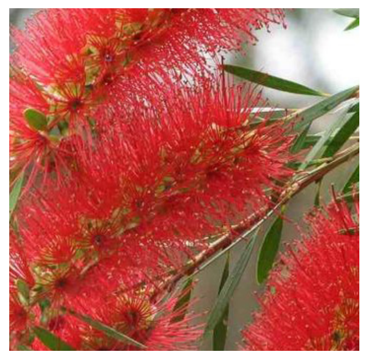
Close-up of Weeping Bottlebrush flowers

An abundance of brilliant red bottle-brush like flowers are produced from spring through summer. The flowers attract many native and non-native birds.