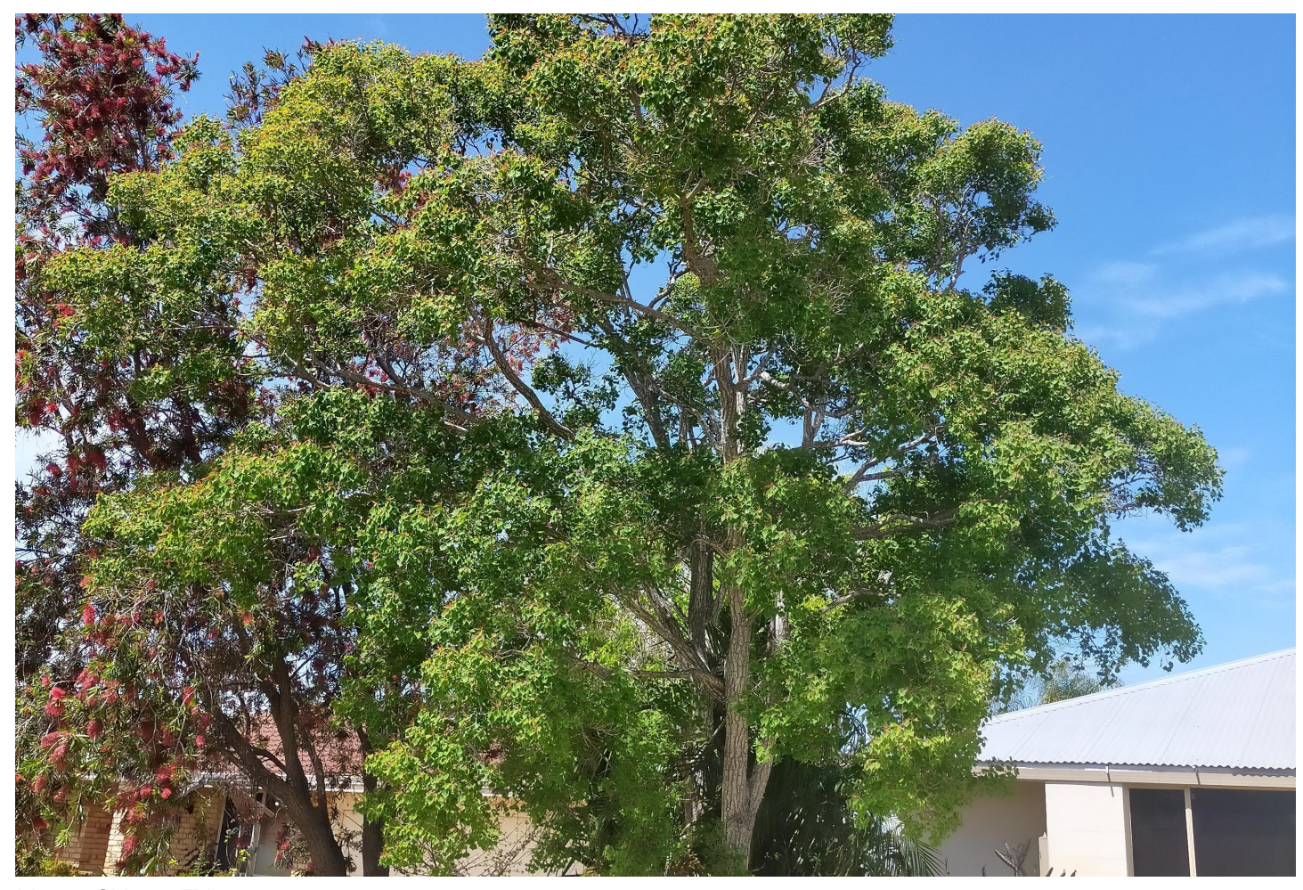
Mature Chinese Tallow