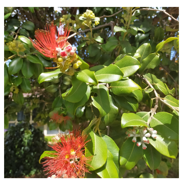
Close-up of Tuckeroo flowers

The tree has smooth grey-brown bark with raised horizontal lines and produces yellow-green flowers in spring followed by decorative orange-yellow seed pods in summer.