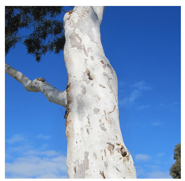
Close-up of Little Ghost Gum bark

The tree has smooth, stark white bark that extends the length of the trunk to small twigs. Small white-cream flowers appear in spring and summer providing a food source for nectar feeding birds.