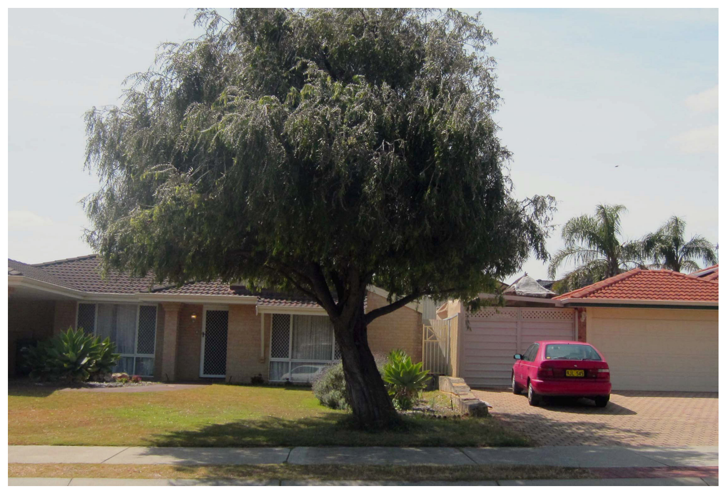
Mature Peppermint Tree