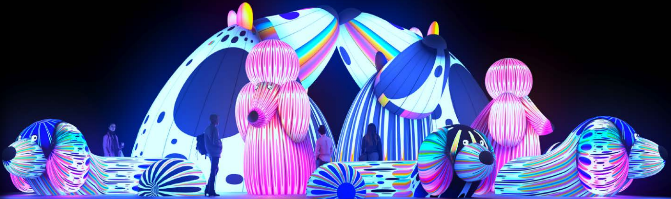
Lost Dog Disco Installation

Friday 11 March was a significant day for the City as the Joondalup Festival returns after a two-year break.