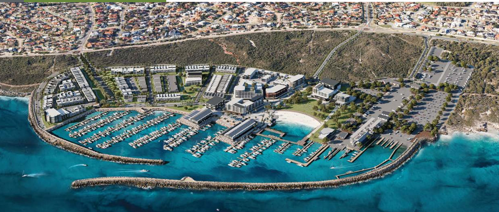
An artist's impression of the Ocean Reef Marina will look.