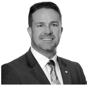
Troy Pickard | Mayor of the City of Joondalup

The City of Joondalup was deeply saddened by the passing of Troy Pickard, Mayor of Joondalup, 2006-2017.