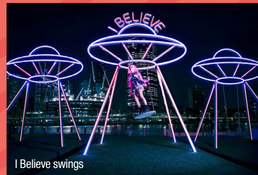
I Believe swings

Adventure through 16 interactive canines as they come to life at night through music, sound, and light at the Joondalup Festival Hub at Hillarys Boat Harbour. These larger-than-life pooches will make their debut at this year's Joondalup Festival.