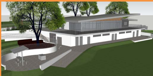
An artist's impression of how Chichester Park will look.